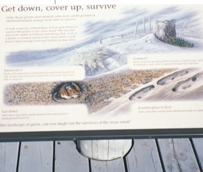
The panel at Mount St. Helens, USA, uses a clear hierarchy of text.

what the exhibition is about, it also explains its