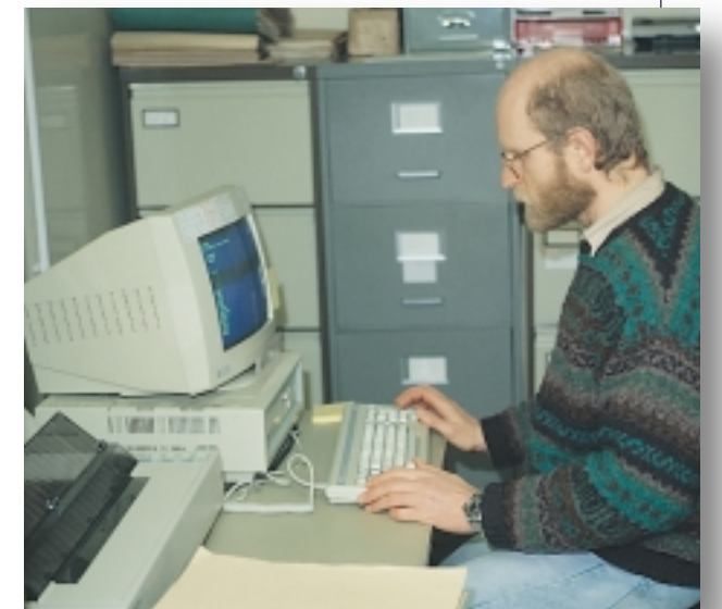
Questionnaires provide data which can be analysed statistically.

some in depth evaluation, and in particular if you want to use statistical analyses, you will need to follow up these issues in the books suggested in the reading list.