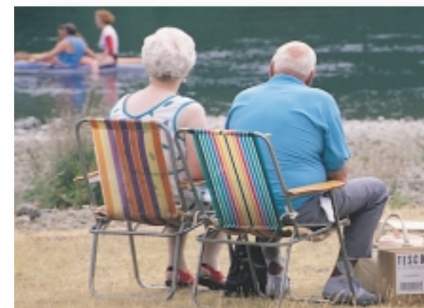
Try to find out what makes a special place for all age groups.

means going back to original documents: letters written at the time you are researching; estate archives; old publications. Doing this will give you more insight into the people concerned, and may produce interesting quotations or pictures which you can use in the interpretation. It also means that