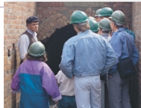
At Beamish, guides provide the most lively and personal interpretation.

Test ideas as much as possible. Use mock-ups of your leaflets or displays to see if they work. Allow