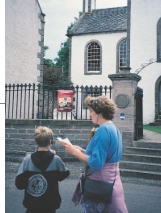
Interpretation at Cromarty Courthouse was planned to complement other developments in the area.

At some point you will also need to ask whether the interpretation is working as planned, and make any changes necessary to improve it.