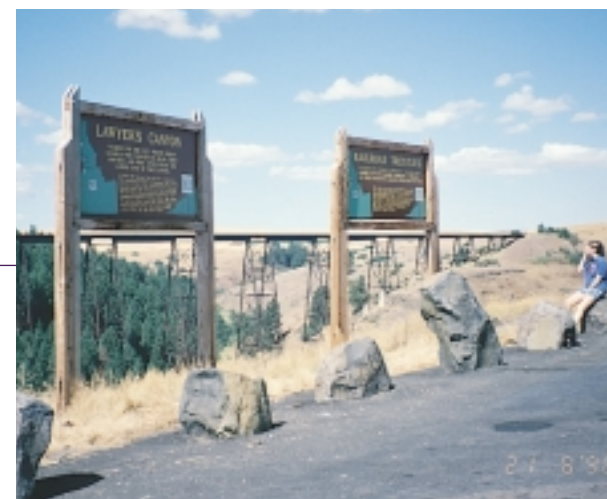
Panels can make ugly intrusions into the landscape, like these at Lawyers Canyon, Idaho, USA.