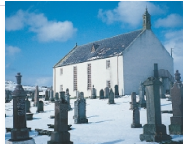
The old parish church, Bettyhill, now Srathnaver museum.

This has vital implications for what you offer, and how you offer it. Visitors come with expectations of their own: you need to meet these before you can hope that they will take an interest in what you have to tell them. At a basic level, this means providing information about where they are,