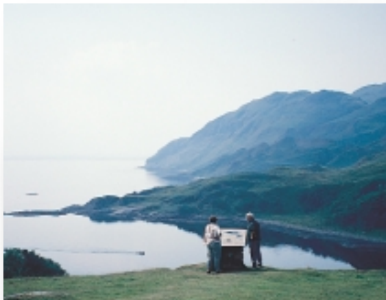
Camas nan Geall in Lochaber.