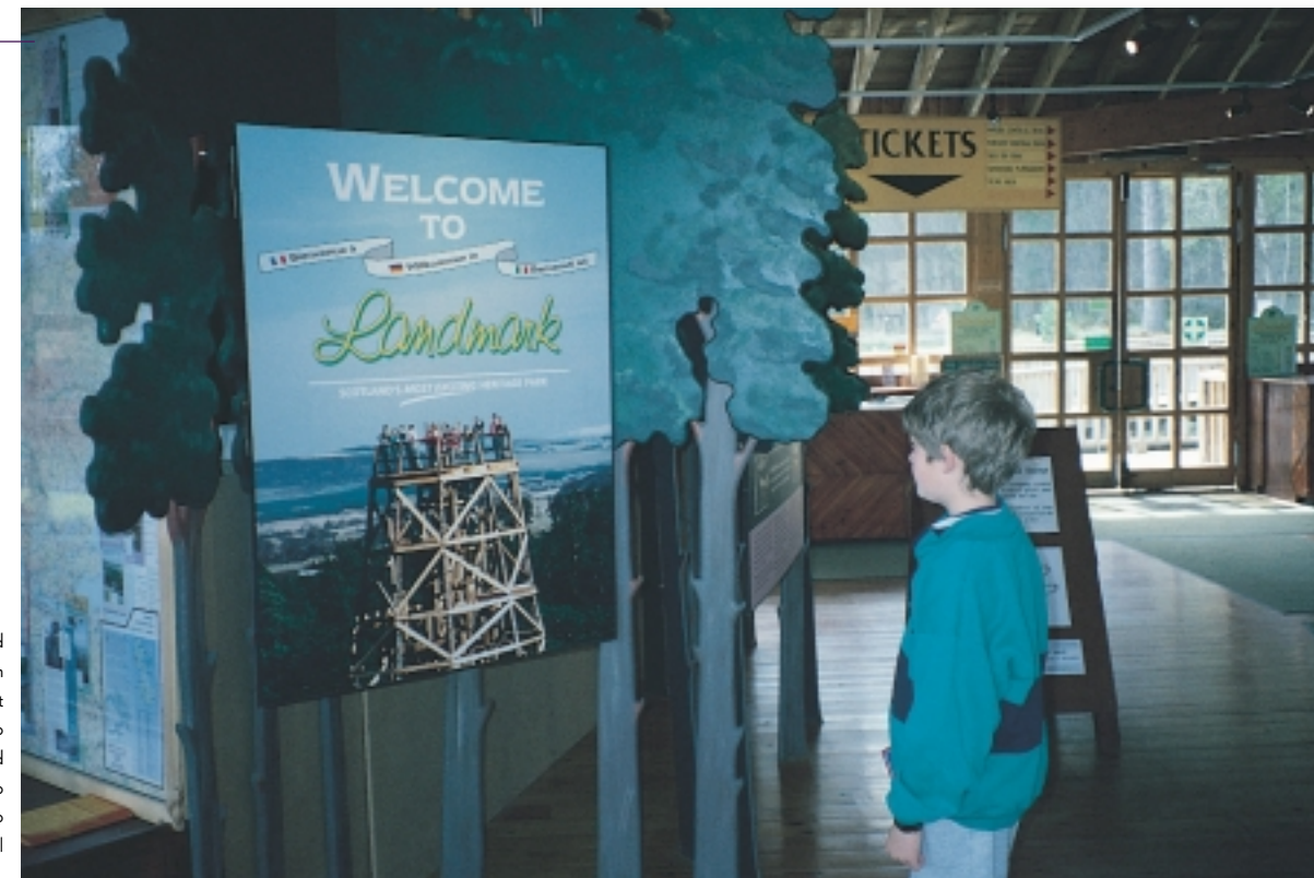
Good interpretation helps tourist attractions to succeed, and thus to contribute to the local economy.