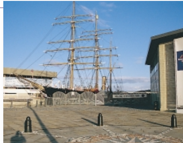
Interpretation at Discovery Point in Dundee must attract as many visitors as possible.

This is the most important question of all. Interpretation can play a part in heritage management, tourism, and community development schemes. It's essential that all those involved agree what a project is for, and who will benefit from it. State your aims as clearly as possible, and spend as much time as you need to get a set of aims which everyone can agree. Aims are like the foundations of