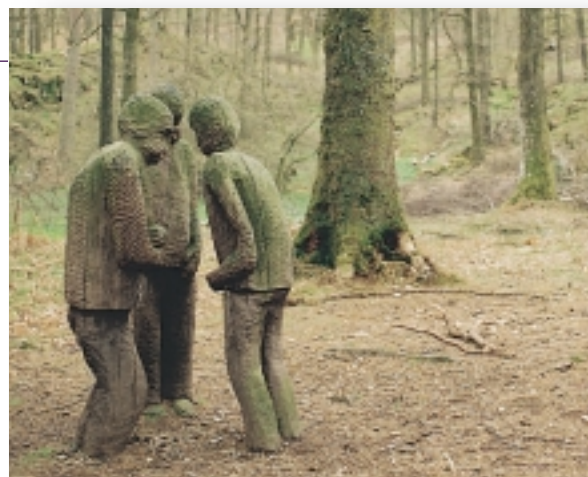
At Grizedale Forest, these sculptures focus the stillness and privacy of the woods: a subtle form of interpretation.

The principles covered in this book apply to all of these; we have simply used 'place' in most of the examples to save repeating the list each time. The handbook aims to help you both to plan interpretation which will be effective, and to involve local people as much as possible in the process.