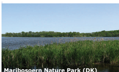
Maribosoerne Nature Park (DK)

Participants also examined the issues of the Charter in the context of the European Landscape Convention, visitor