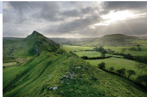
Chrome Hill, Peak District National Park.