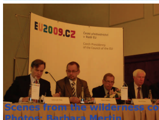
Scenes from the wilderness conference.

By the end of the conference participants had put together a "Message from Prague" including recommendations to the European Commission, EU Member States and other stakeholders to work on the areas of policy development, awareness building, information provision and supporting capacity. Download the full text of the "Message from Prague" .