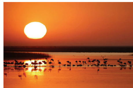
Certified Charter Protected Area Coto Doñana national park.

Read more about the European Charter Partner Programme