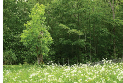
Garphyttans National Park, Sweden