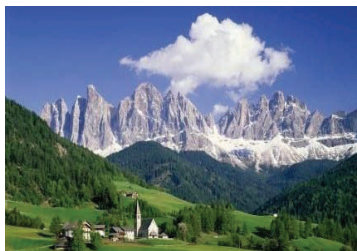
The Dolomites (IT)

The Dolomites (Italy) comprise a mountain range in the northern Italian Alps, numbering 18 peaks which rise to above 3,000 metres and cover 141,903 ha. The area includes seven protected areas (four of which are EUROPARC members): the Dolomiti Bellunesi National Park, the Natural Parks of Paneveggio Pale di San Martino, Adamello Brenta, Dolomiti Friulane, Dolomiti d'Ampezzo, Dolomiti di Sesto and Fanes Senes Braies. It features some of the most beautiful mountain landscapes, with vertical walls, sheer cliffs and a high density of narrow, deep and long valleys. The nine areas present a diversity of spectacular