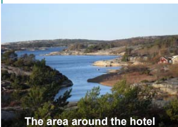
The area around the hotel

The venue and location are excellent with much to interest and stimulate Federation members. Many of the study visits will be of a marine and coastal nature, but landlubbers too will have a good choice. The conference title "A shared inheritance; a common future" will be explored through the themes of adaptation and benefits and connectivity, which will be explored in detail through topics such as biodiversity, coastal and marine, sustainable use and climate change – mitigation and management.