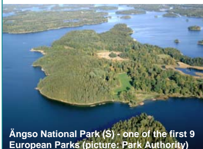
Ångsö National Park (S) - one of the first 9 European Parks

We have already developed a project concept and are currently in the process of looking for project sponsors .