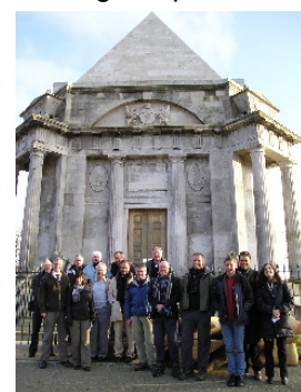
EAI London seminar participants, Jan 09.

Read on at www.europarc.org/january-e-news