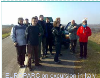
EUROPARC on excursion in Italy

In January, representatives from the Federation's Sections and our Council met at the beautiful Delta del Po Regional Park (IT). The area is a birdwatcher's paradise, a gastronome's delight and the artistic heart of European civilisation with an abundance of UNESCO World Heritage sites. Our Italian hosts took great pride in showing us their area as we discovered the international projects they are engaged in.