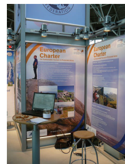
Promoting the Charter at the Reisepavillon