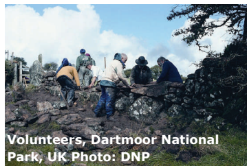
Volunteers, Dartmoor National Park, UK