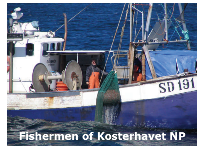
Fishermen of Kosterhavet NP

Read more about the conference at the EUROPARC website. Registration will start on 11th May! We will inform you regularly about the event in upcoming EUROPARC e-news' and other publications.