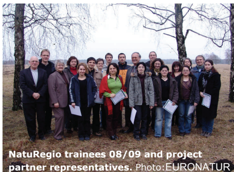
NatuRegio trainees 08/09 and project partner representatives.