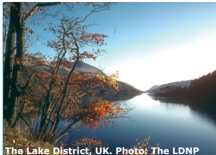
The Lake District, UK.

EUROPARC Federation's consultancy, EUROPARC Consulting , is particularly delighted to have been engaged to carry out a significant comparator study on a much cherished and world-famous area of the UK. The Lake District World Heritage Project is seeking UNESCO World Heritage Site inscription for the Lake District as a Cultural Landscape.