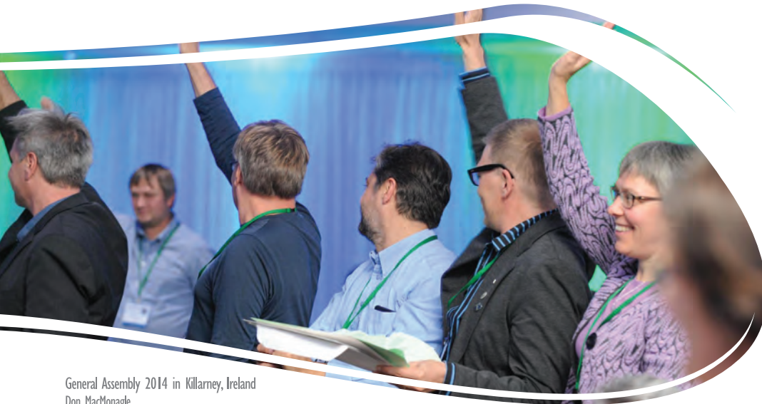
General Assembly 2014 in Killarney, Ireland

With the addition of Fedenatur into EUROPARC, we now represent and support the work of periurban parks across Europe.