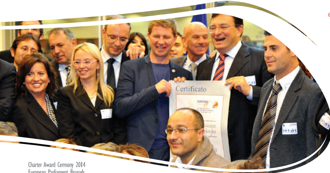
Charter Award Ceremony 2014 European Parliament, Brussels