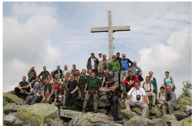
Picture 1: Participants TransParcNet meeting 2015 on top of Mount Lusen in National Park Bavarian Forest

2015 saw from 9 th to 12 th June the 7 th edition of EUROPARC's TransParcNet meeting, the annual get-together of experts in cross-border cooperation of protected areas. 45 participants joined EUROPARC this year in České Žleby in Šumava National Park (CZ), who together with their transboundary partner Bavarian Forest National Park (DE) hosted the event in their protected areas. During this year's reunion, the participants had the chance to learn about the value of healthy ecosystems for nature and people, looking at natural dynamics of ecosystems as well as at restoration projects in the two parks. Presentations on cooperation initiatives in Estonia and Latvia, cross-border networks like the European Green Belt and current research initiatives on transboundary cooperation have also been on the programme.