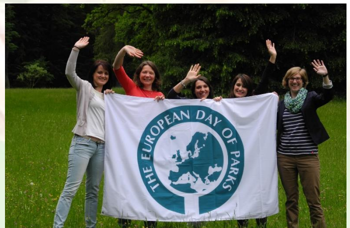
EUROPARC Directorate Team at European Day of Parks 2014

For more information , visit EUROPARC website.