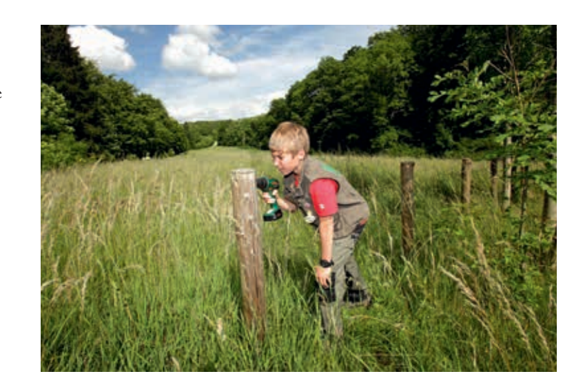
Junior Rangers are at home in the outdoors