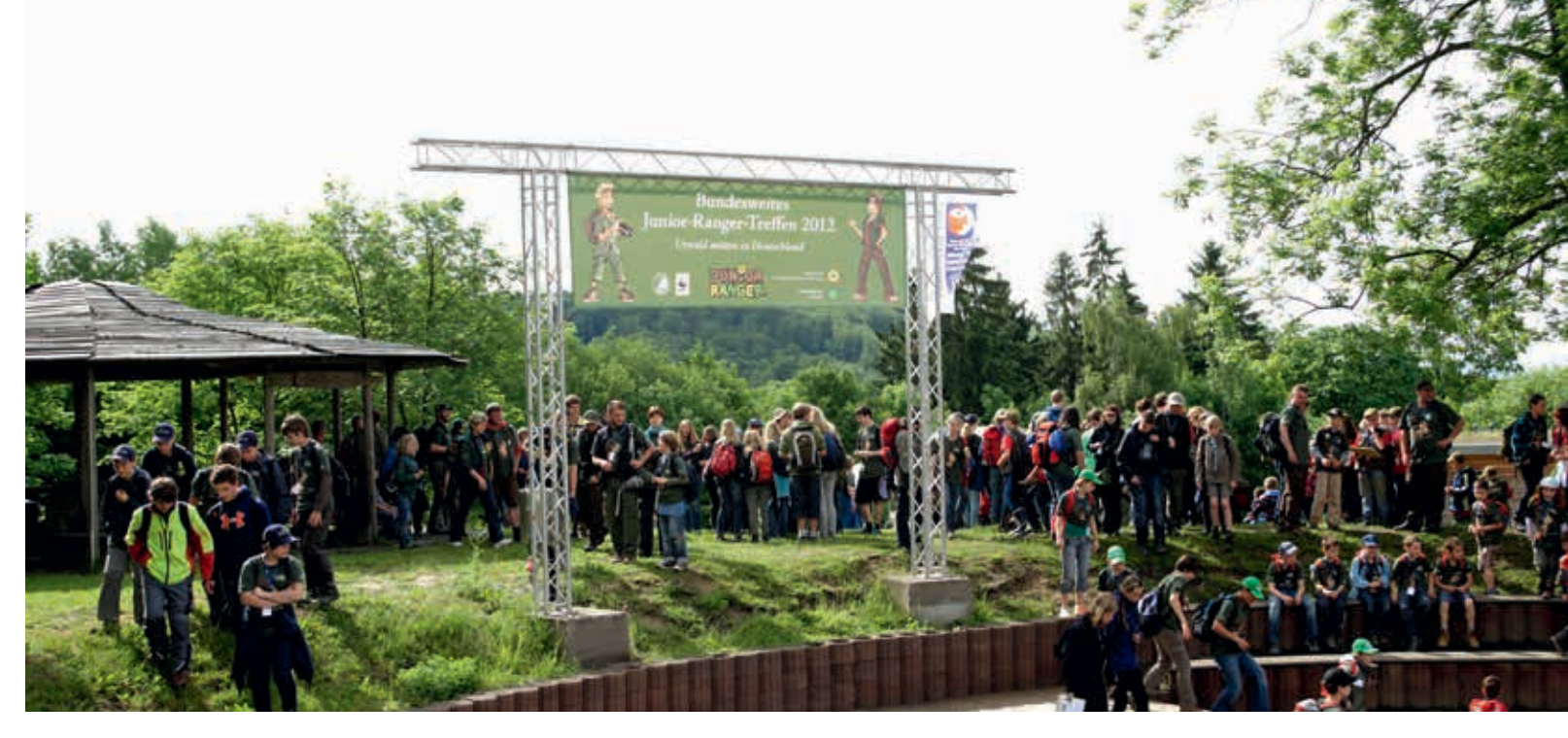
Junior Rangers at a national meeting in the Hainich National Park and Eichsfeld-Hainich-Werra Valley Nature Park

"Junior Ranger" is an educational programme that is fun for children and teaches them decision-making skills.