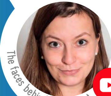
The faces behind the project

Working in groups, learning experiences will be delivered by a mix of face-to-face workshops and a summer school, as well as a range of online and digital tools such as webinars, interactive online exercises, demonstration videos and a smartphone 'virtual twinning' app.