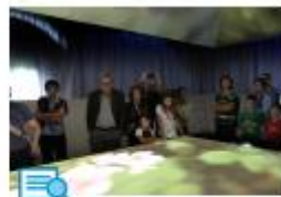
The "Casa del Parco": an interactive multimedia facility, inside the Cascina Centro Parco Nord Milano