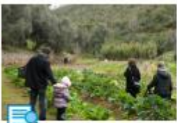
Quinta do Pisão Nature Park – A landscape-scale conservation project that links wildlife and people