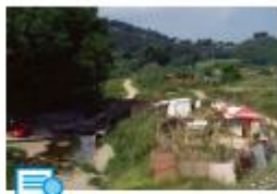
Recovery of 2 degraded areas on the Collserola Natural Park boundaries