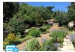
Creation of an educational botanical garden in the Mt. Hymettus Aesthetic Forest