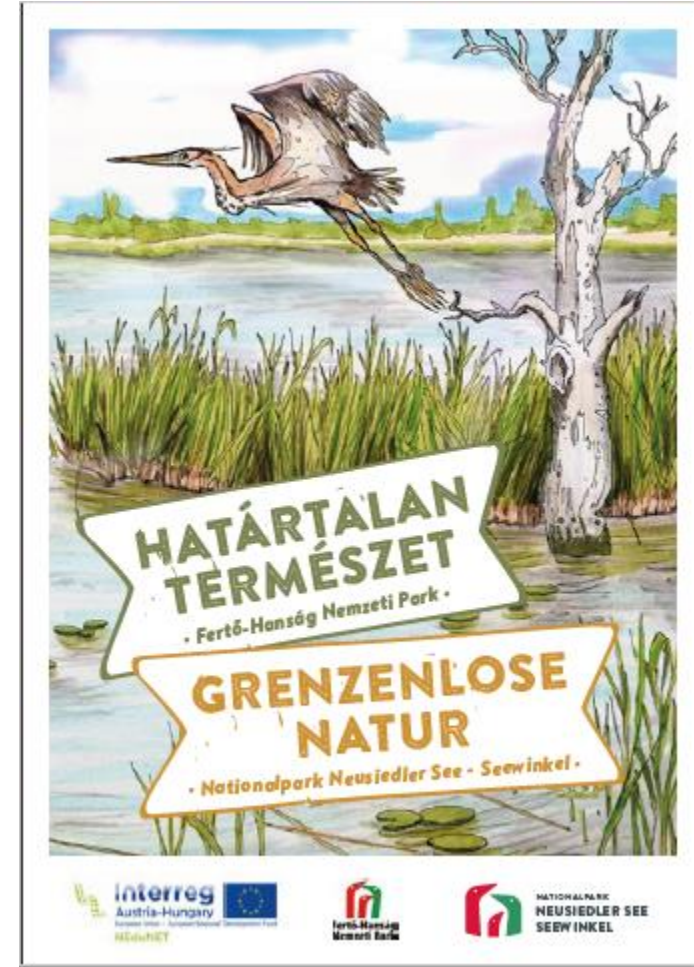
Bilingual brochure for kids