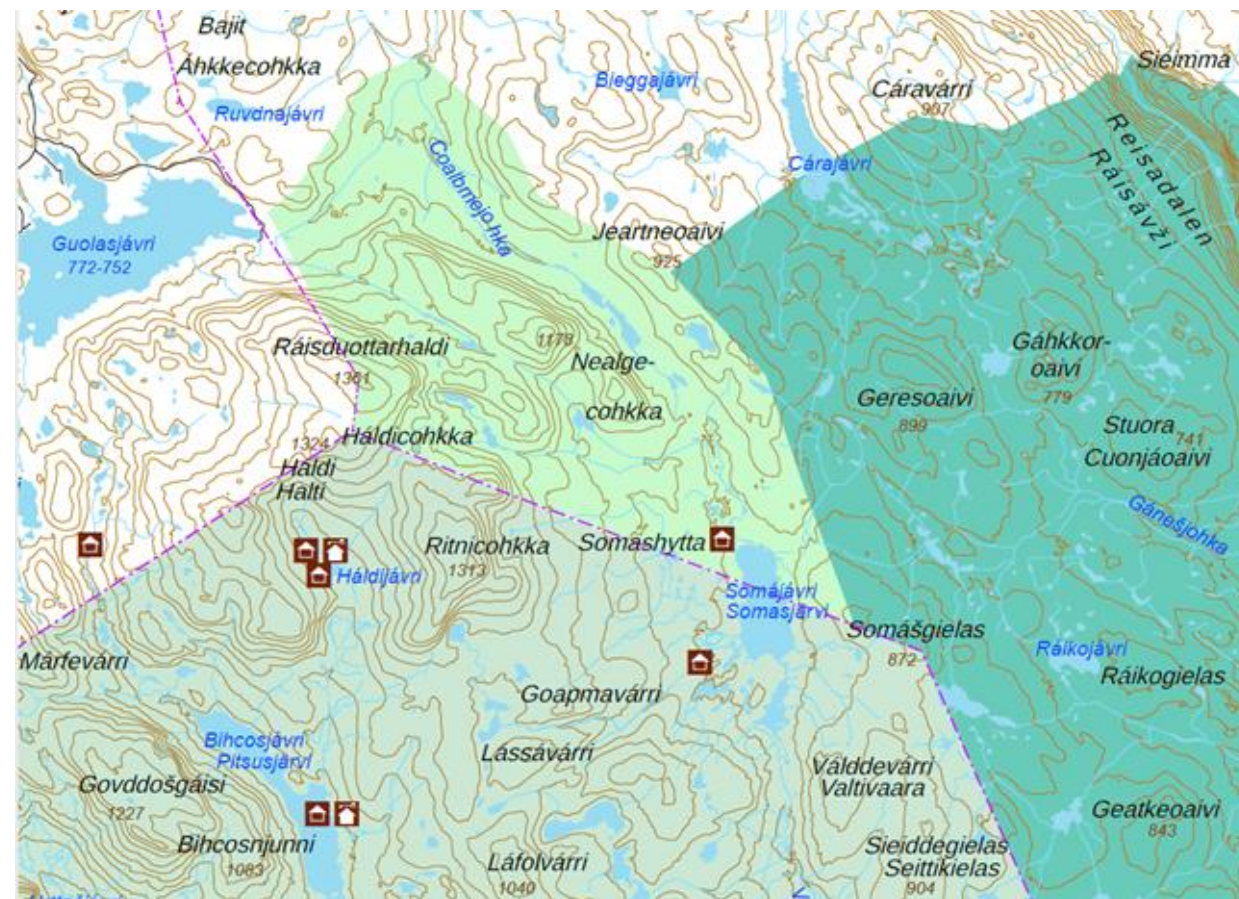
Topographic map combining terrain and infrastructure in Háldi Transboundary Area

Further info from Pertti Itkonen, pertti.itkonen@metsa.fi