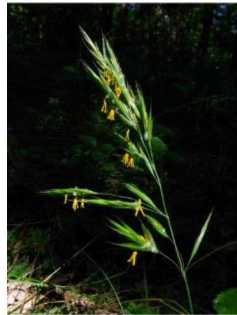
B. ramosus