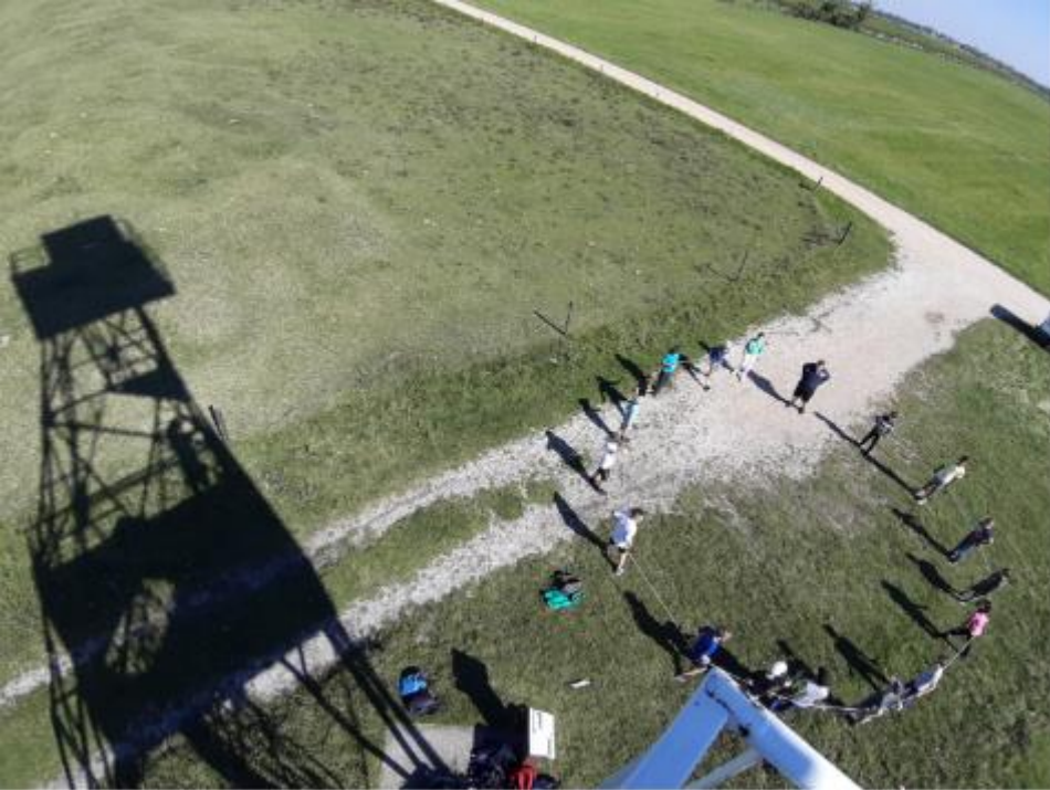
Above: Programme for schools Right: Training employees

The NatureEducationNetwork (NEduNET) project is a cross-border Interreg project of the National Park Neusiedler See - Seewinkel and the Fertő - Hanság Nemzeti Park. Its goal is to strengthen the perception of the cross-border nature reserve Neusiedler See - Seewinkel / Fertő - Hanság as common natural heritage especially in the minds of the regional population.