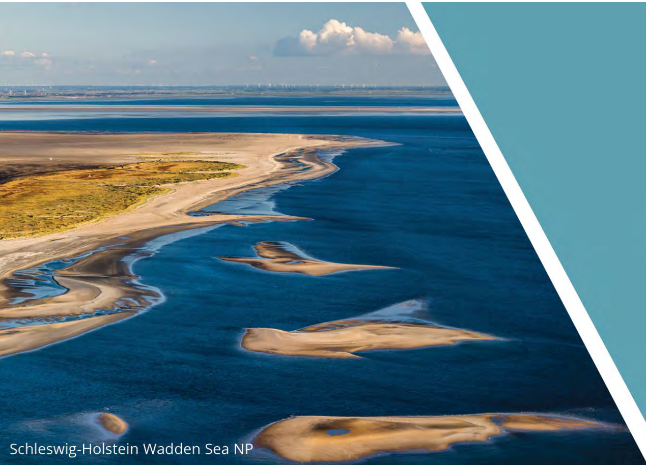
Schleswig-Holstein Wadden Sea NP