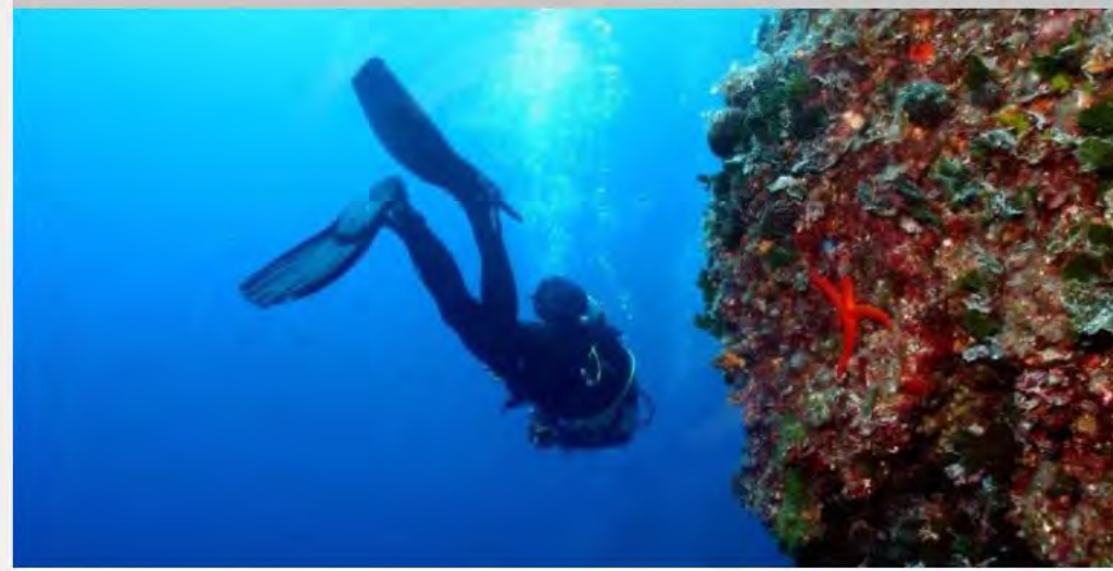
Kornati National Park (HR)

Seas and oceans offer huge biodiversity, play an indispensable role in climate change mitigation, and provide food and employment to people. Certain structures such as coral reefs and seagrass meadows protect the coasts against storms and flooding. Coastal areas provide a nursery habitat for many ecologically and economically important species. The ocean is a source of food through fisheries and aquaculture.