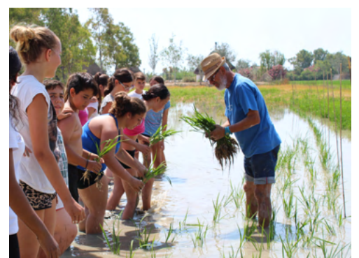
Winners of the 2019 STAR Awards, top to bottom:

Sud Randos © Chantal Breuillaud; © La calma; © Hotel Caminetto; © Delta Polet