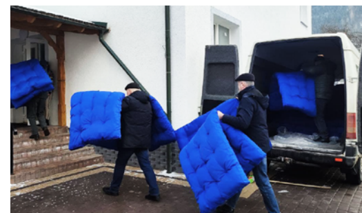
Mattresses purchased by FZS Ukraine are delivered to park infrastructure converted to lodge IDPs in the Carpathians.