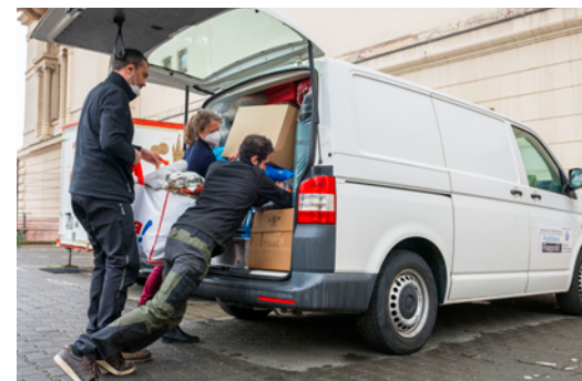
Equipment bound for Ukraine is loaded into a vehicle in Frankfurt.

Please note: The situation in Ukraine remains unpredictable. Should you be contacted by the press regarding coverage of support to protected areas in Ukraine please contact crisiscommunication@fzs.org for further guidance. For all other questions please visit: www.fzs.org/en/service/contact .