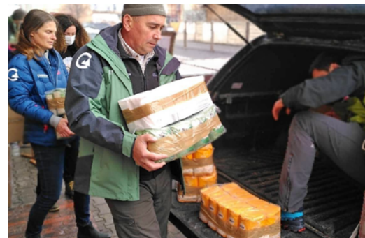
FZS partner project in Romania – Foundation Conservation Carpathia – load a vehicle convoy with food and other supplies destined for Ukraine.

people have sought refuge in and around protected areas in Polesia and the Carpathians