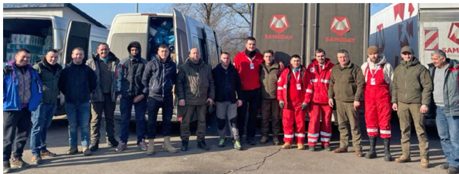
Ukrainian protected area staff collect a batch of supplies at the border – sent from Romania, with the support of Sameday logistics.