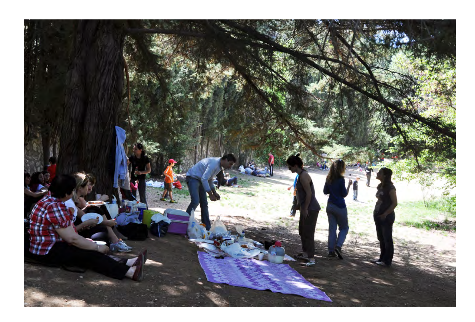
An overcrowding day in the central area of the Mt. Hymettus Aesthetic Forest

In this case, the manager must evaluate the carrying capacity of the space and come to a corresponding agreement with the educational institutions.