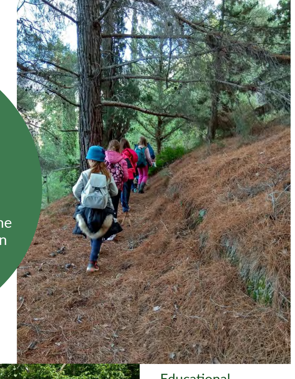
Educational activities at Mt. Hymettus Aesthetic Forest

Kindergartens – Schools Educational institutions with sports activities Educational institutions with the aim of environmental education Summer campuses