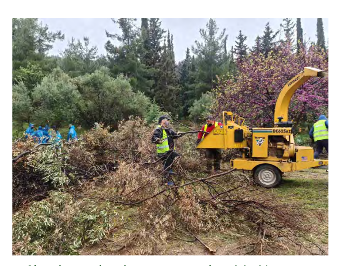
Cleaning and maintenance work at Mt. Hymettus Aesthetic Forest

In this part, environmental education can contribute by raising awareness and learning the right way to behave in a natural environment. So with their visit to the area, when leaving, they should have taken all their garbage with them and not have caused damage to the facilities of the area.