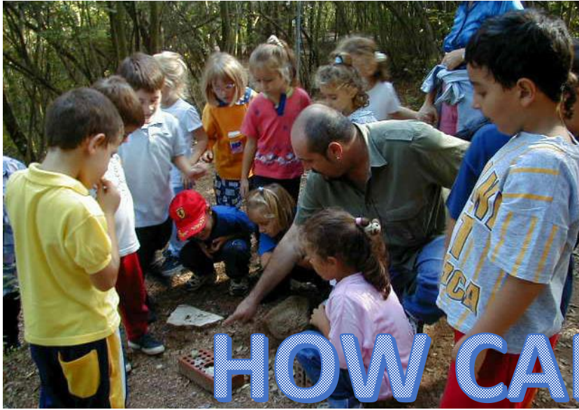
PROGRAMS WITH SCHOOLS