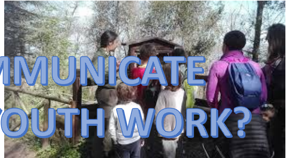
FAMILY WORKSHOPS / GUIDED TOURS FOR FAMILIES