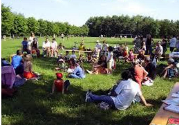
OPEN DAYS / FESTIVALS