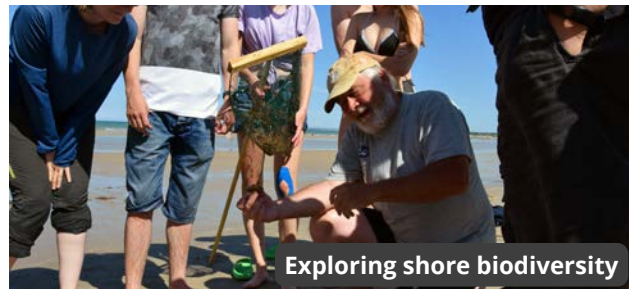
Exploring shore biodiversity