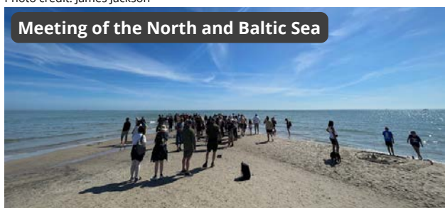
Meeting of the North and Baltic Sea