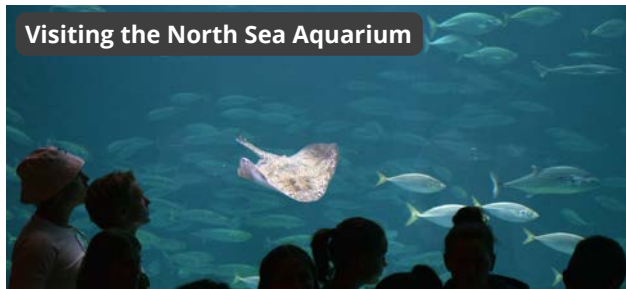
Visiting the North Sea Aquarium