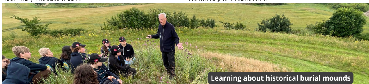
Learning about historical burial mounds