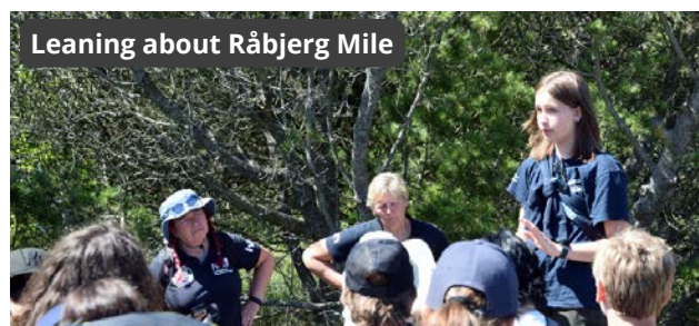
Learning about Råbjerg Mile