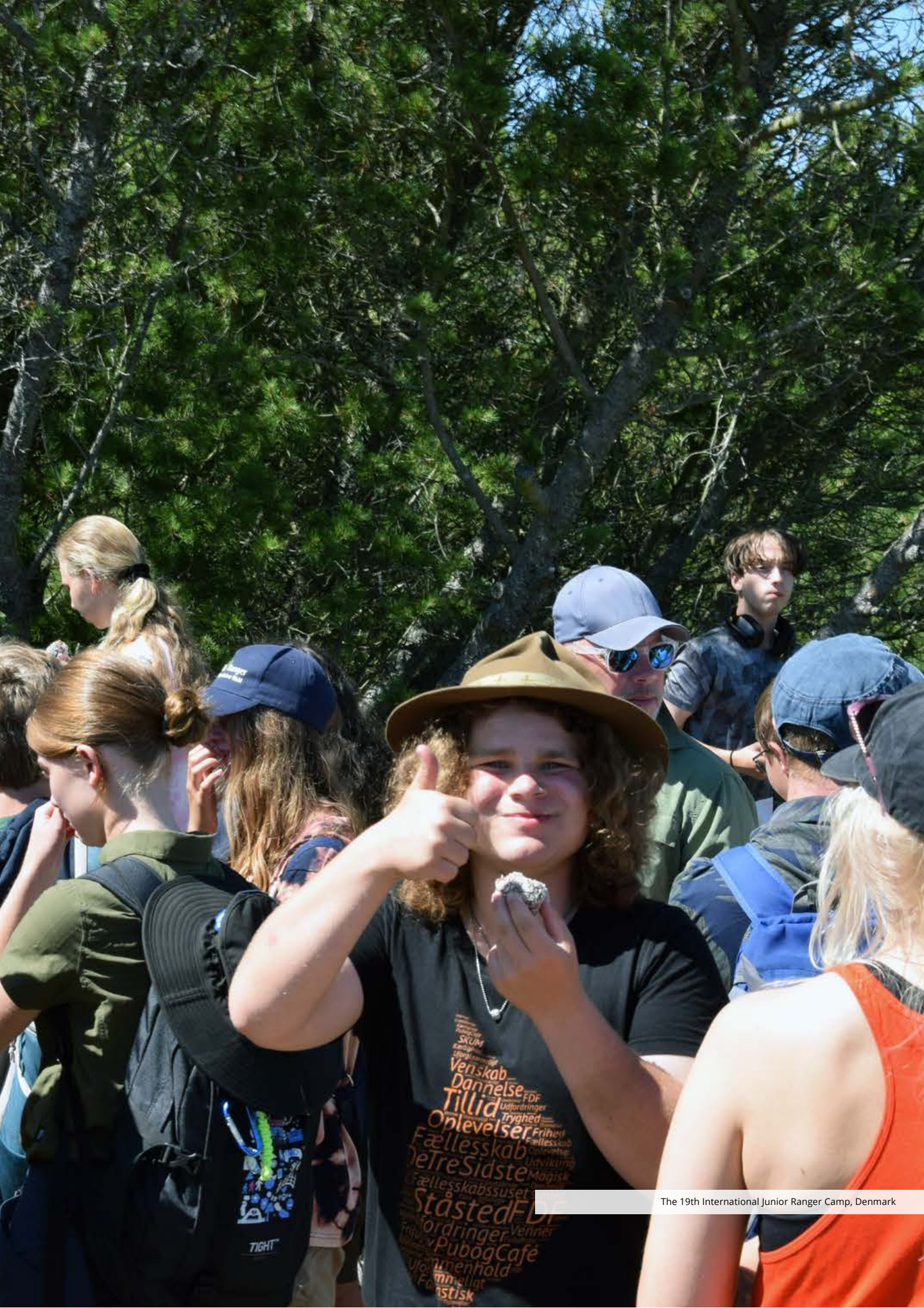
The 19th International Junior Ranger Camp, Denmark