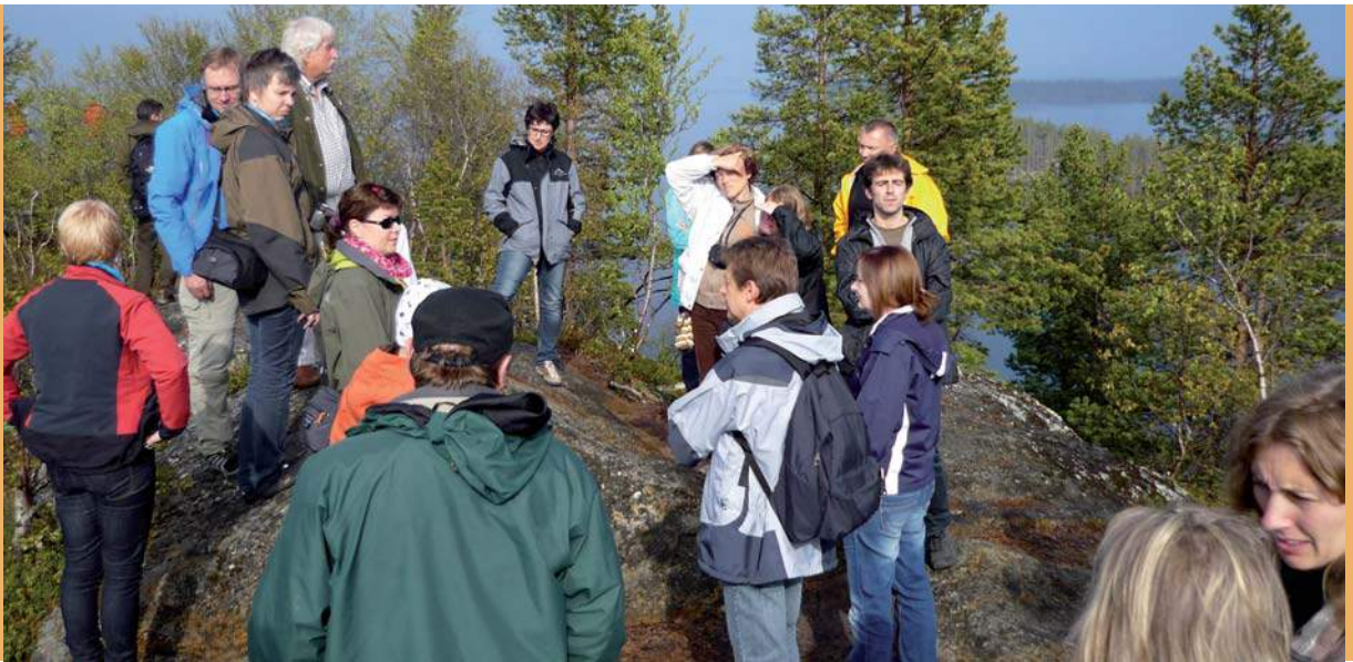
TransParkNet field trip at Pasvik-Inari Trilateral Park