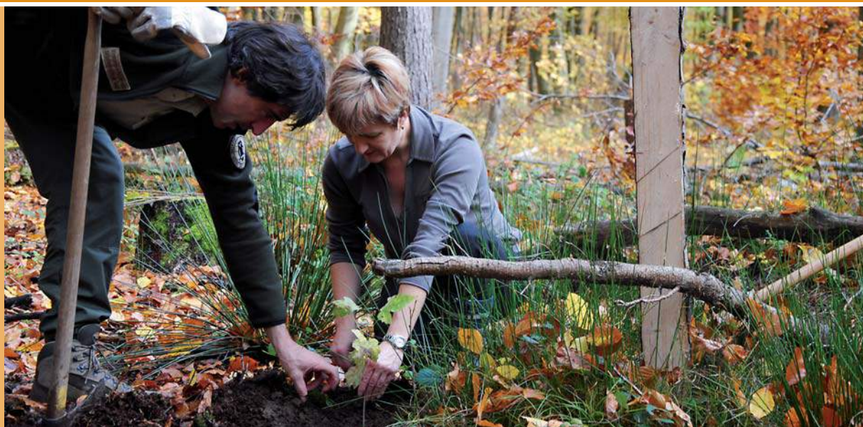
Volunteers plant trees in Biosphere Reserve Bliesgau.

For COP 11 in Hyderabad, EUROPARC Germany was invited to present results of the first evaluation project of German national parks during a side even. Here, reporting obligations, management strategies and financial instruments for protected areas were discussed with international attendees.