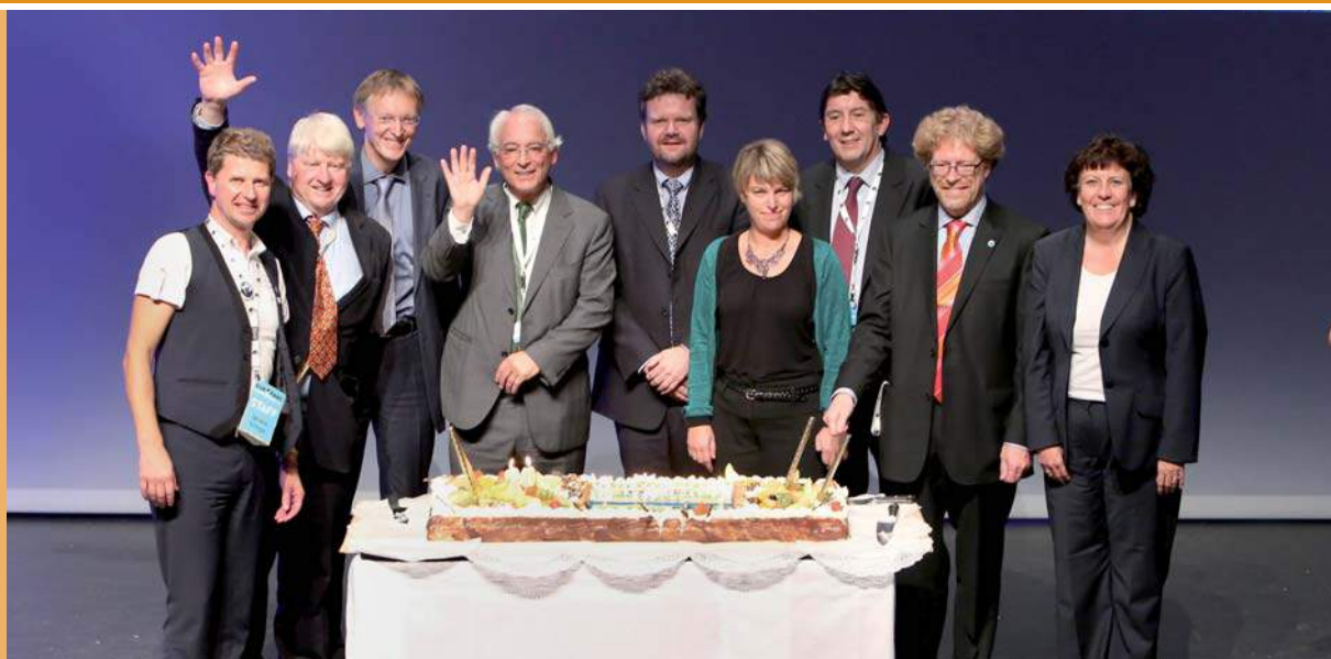
Opening Ceremony of EUROPARC 2012 with high profile guests.