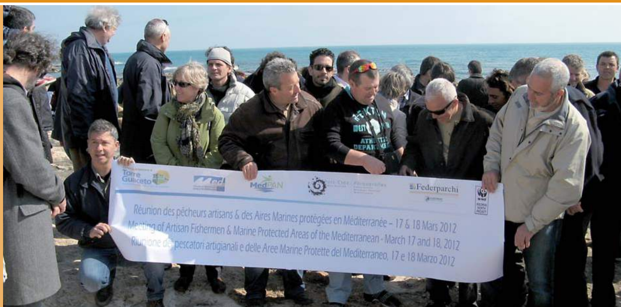
Participants of seminar Marine Protected Areas.

successfully and attracted a very large audience.