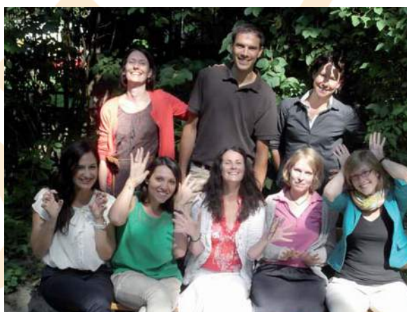
EUROPARC Team 2012