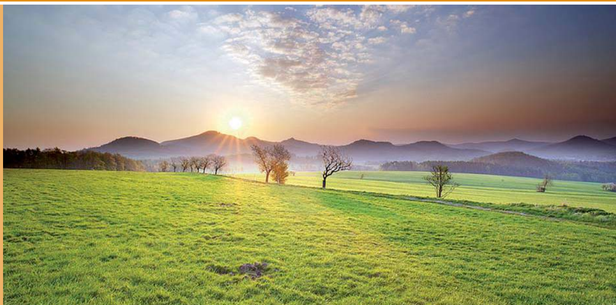
Sunrise impression from Swiss-Bohemian- Switzerland Nationalpark.

A complete revision of the framework and guidelines of the Transboundary Parks Programme was finished and new documents will be published soon. Amongst them are the Magic Numbers which, for the first time, summarise and visualise the benefits of the Transboundary Certificate for protected areas. Copies of good practice examples and the magic numbers of transboundary cooperation can be downloaded from the EUROPARC website.