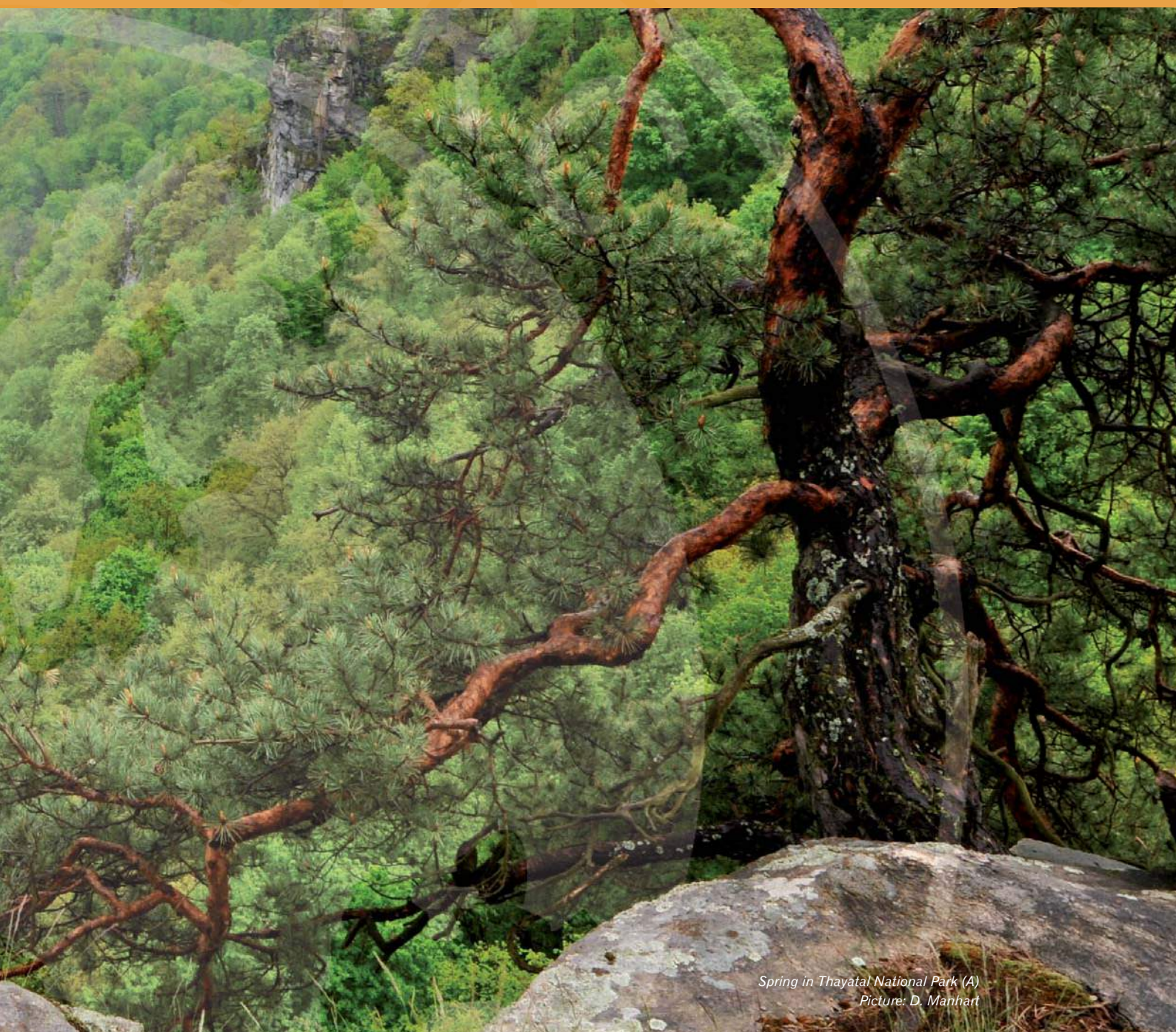
Spring in Thayatal National Park (A)