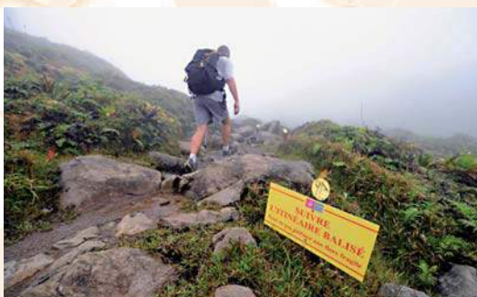
Path signing at National Park Guadeloupe (F).

Contact: Anne L'Epine, anne.lepine@parcnational.fr