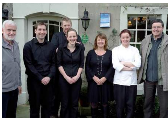
Sustainable Tourism Working Group face-to-face meeting in AONB Forest of Bowland, UK, March 2012.

www.europarc.org/who-we-are/our-working-groups