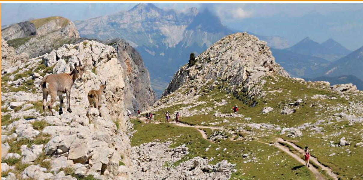
Regional Nature Park Vercors.