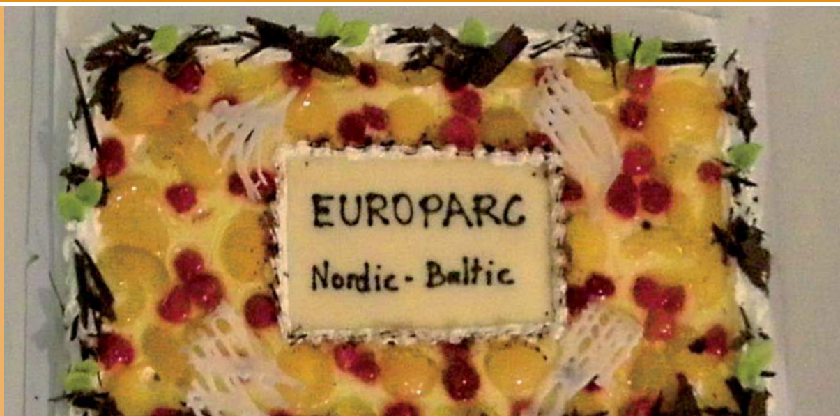
Cake from seminar on green infrastructure.

The section was successful in receiving 3 new members: Mols Bjerge National Park, Abisko National Park and Hamra National Park. Thus we hope that the awareness of the section has increased.