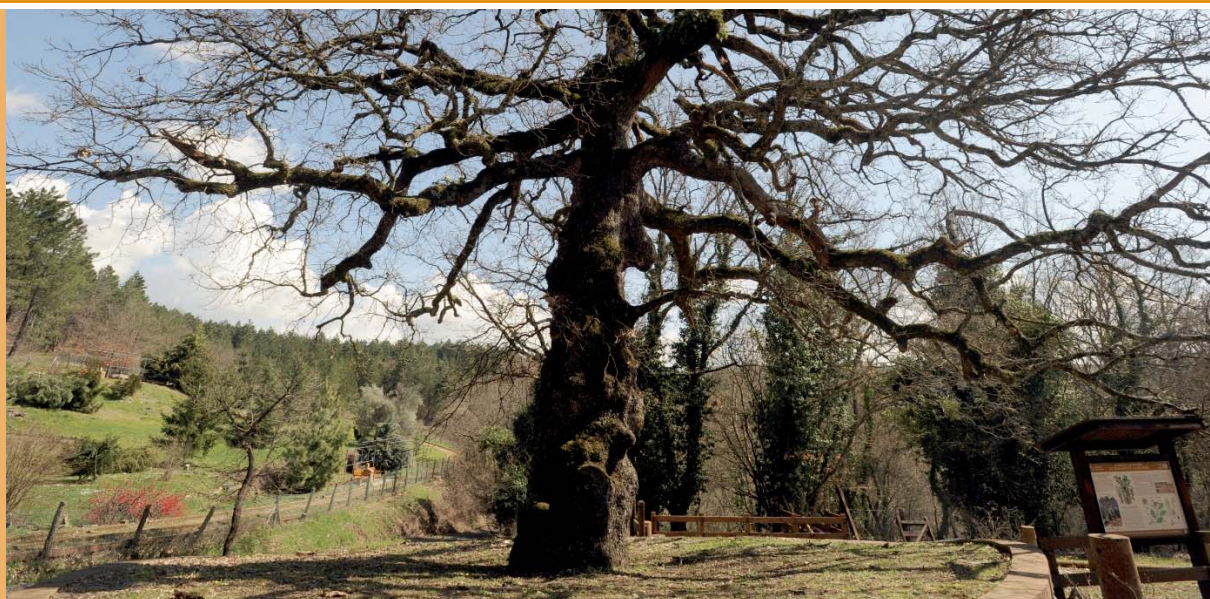
Typical Oak Tree at Monte Rufeno, the 100 th Charter park.