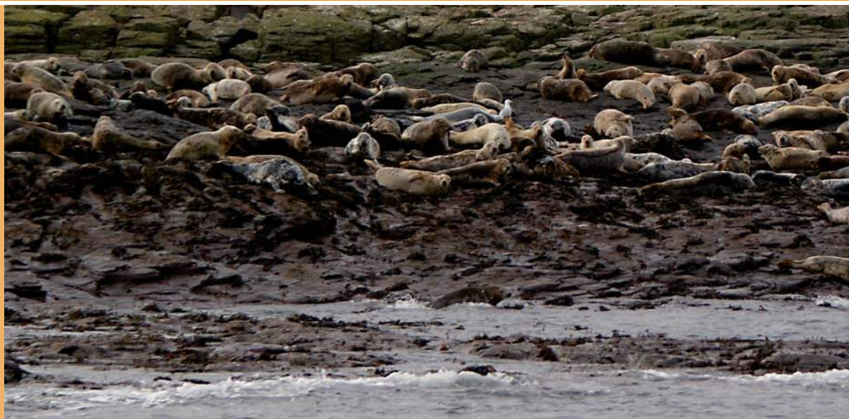
Seals connecting on the Farne Islands, Northumberland Coast AONB