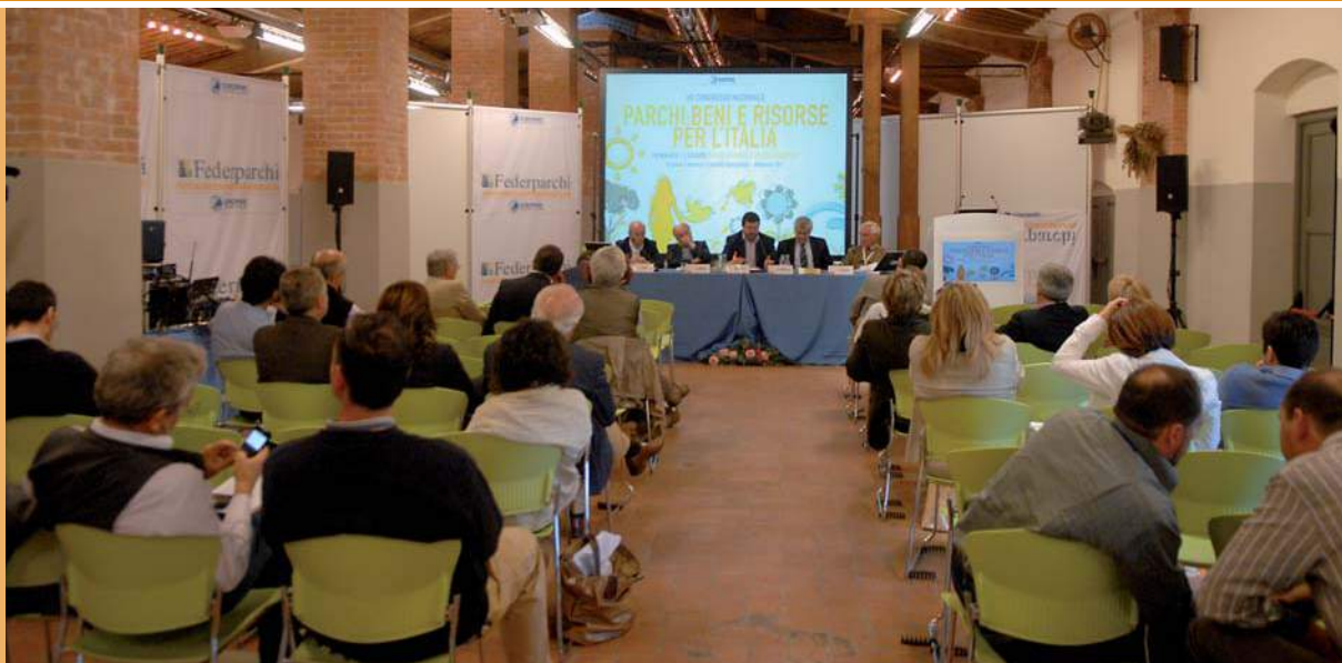
Extra ordinary assembly.