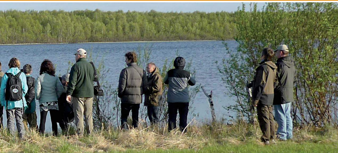
Looking forward to increase collaboration: Participants of TransParkNet meeting 2012, Trilateral Park Pasvik-Inari.