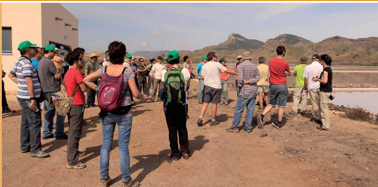
Technical visit during the XVII Conference EUROPARC Spain (Regional Park Calbanque, Murcia).