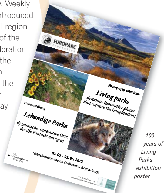
100 years of Living Parks exhibition poster

The exhibition "100 years of Living Parks" was opened by the Mayor of the City of Regensburg in the Museum of Natural Science Eastern Bavaria. It featured for 4 weeks photos and texts throughout May. Weekly presentations introduced the international-region-local approach of the EUROPARC Federation to visitors from the town and region. A highlight was the presentation for the European Day of Parks of Martin Šolar, director of the Triglav National Park.