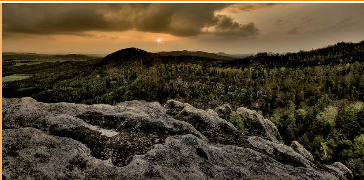
Sandstone Landscape, National Park České Švýcarsko and Protected Landscape Area Labské pískovce (CZ)

This was realized as one of the activities of the Czech Section in 2012. The Czech Section also coordinated the participation of an expert speaker in the seminar “Protected areas as part of green infrastructure” organized by the Nordic-Baltic Section in March in Roosta, Estonia.