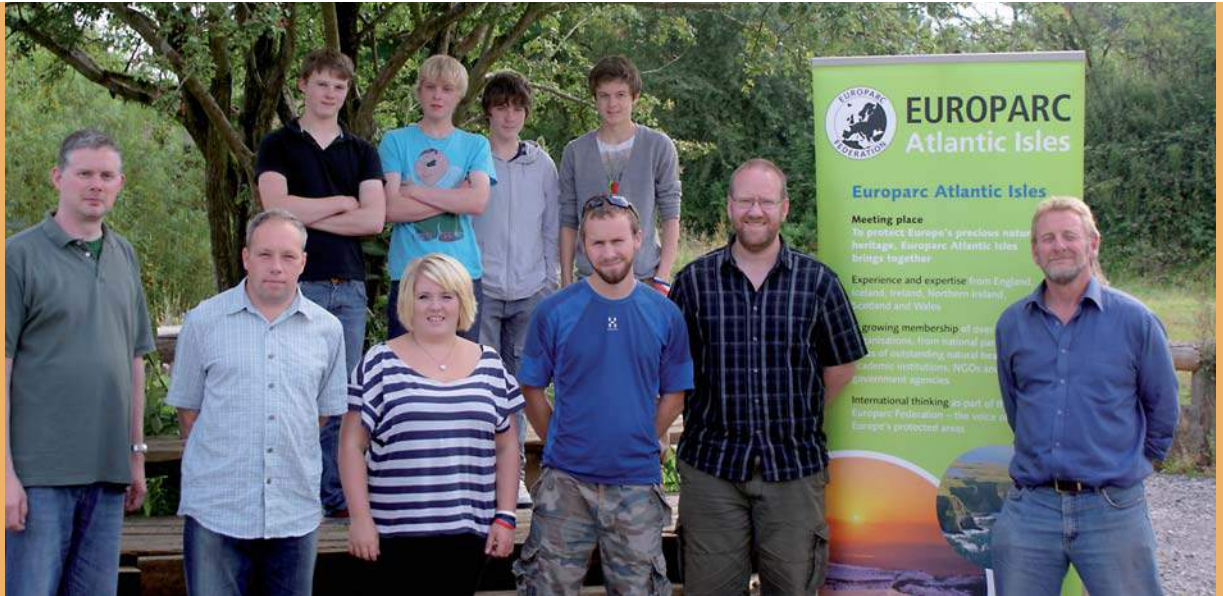
Young Ranger Project Group of EAI in the Mendip Hills AONB, August 2012