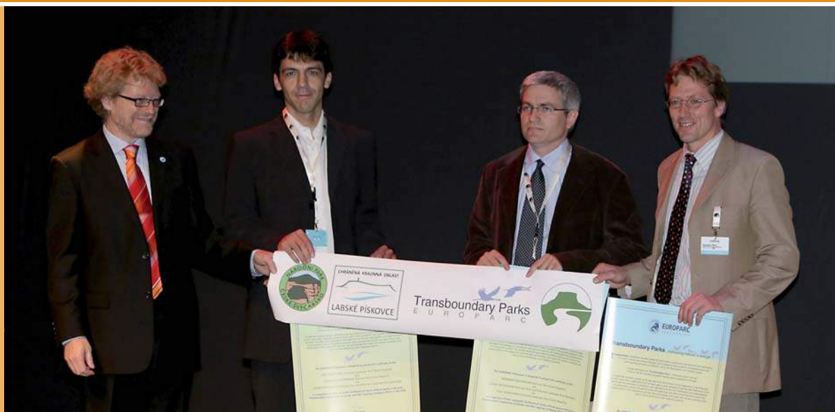
Transboundary award ceremony at EUROPARC 2012.