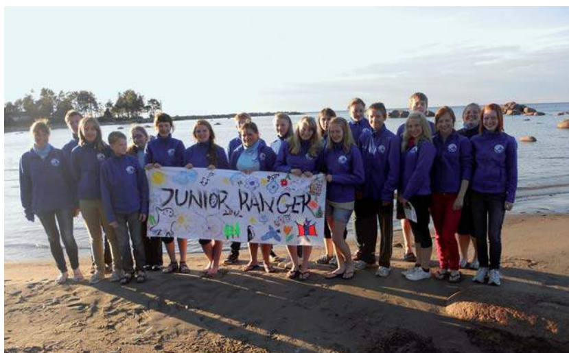
Junior Rangers and their mentors at Lahemaa National Park (EST).