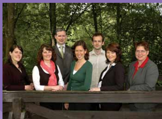
Directorate team.

The Directorate of the EUROPARC Federation is the engine of the organisation. With a small team of six and additional assistance from our intern, we are responsible for all strategic and operational functions. The team manage all aspects of a number of important European projects and represent the Federation and our member's interests across a range of agenda. The work carried out during the second half of 08 by the team is summarised below.