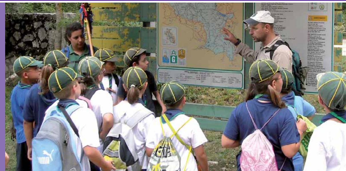
Cubs volunteering in Abruzzo, Lazio e Molise National Park