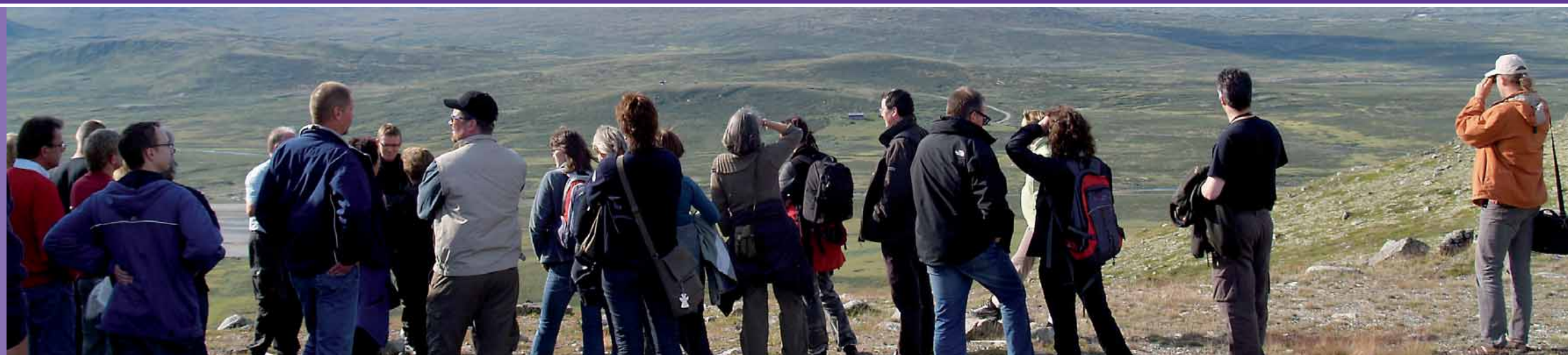
Participants of the Nordic Baltic Seminar in Norway.