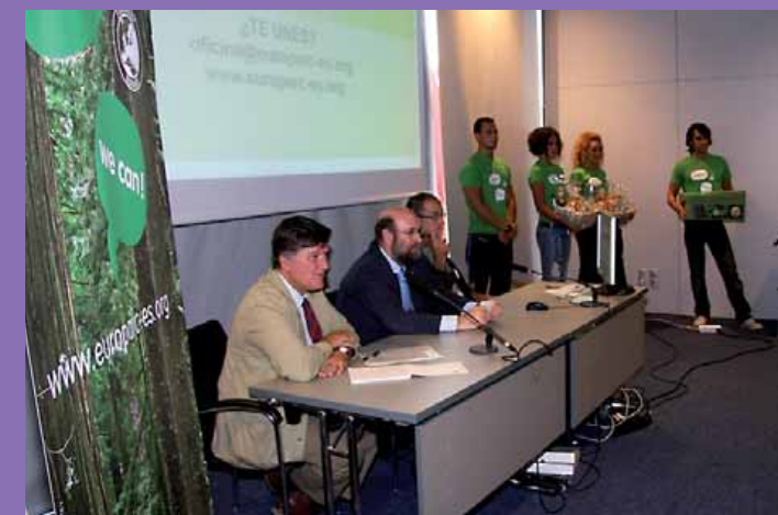
EUROPARC Spain at the IUCN Conference in Barcelona