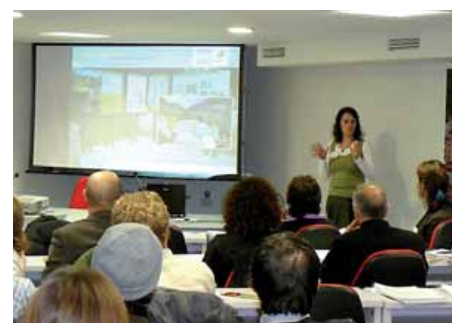
European Charter Information Seminar. Picture: EUOPARC