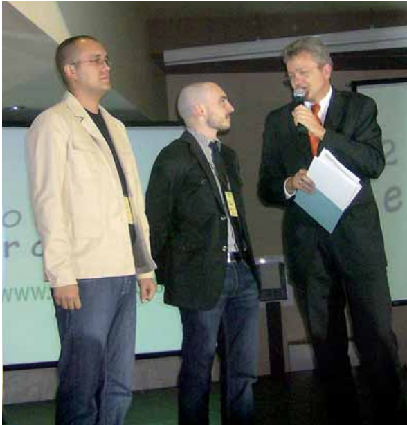
Two of the three Alfred Toepfer scholarship winners.