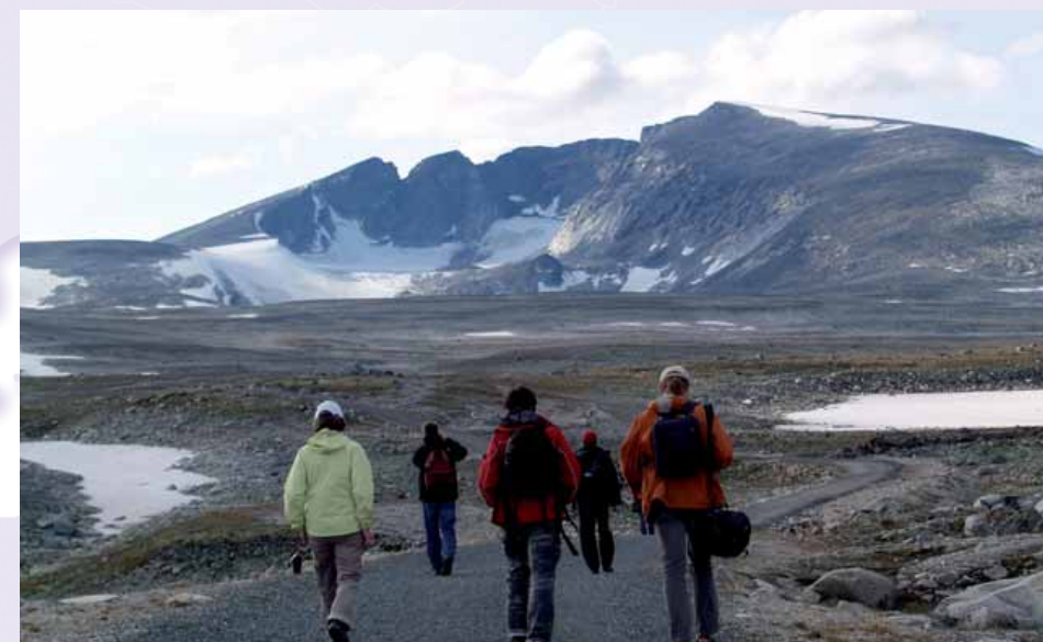
Participants of the Nordic Baltic Seminar in Norway.

The next Section meeting will take place in Stockholm, Sweden in February 2009.