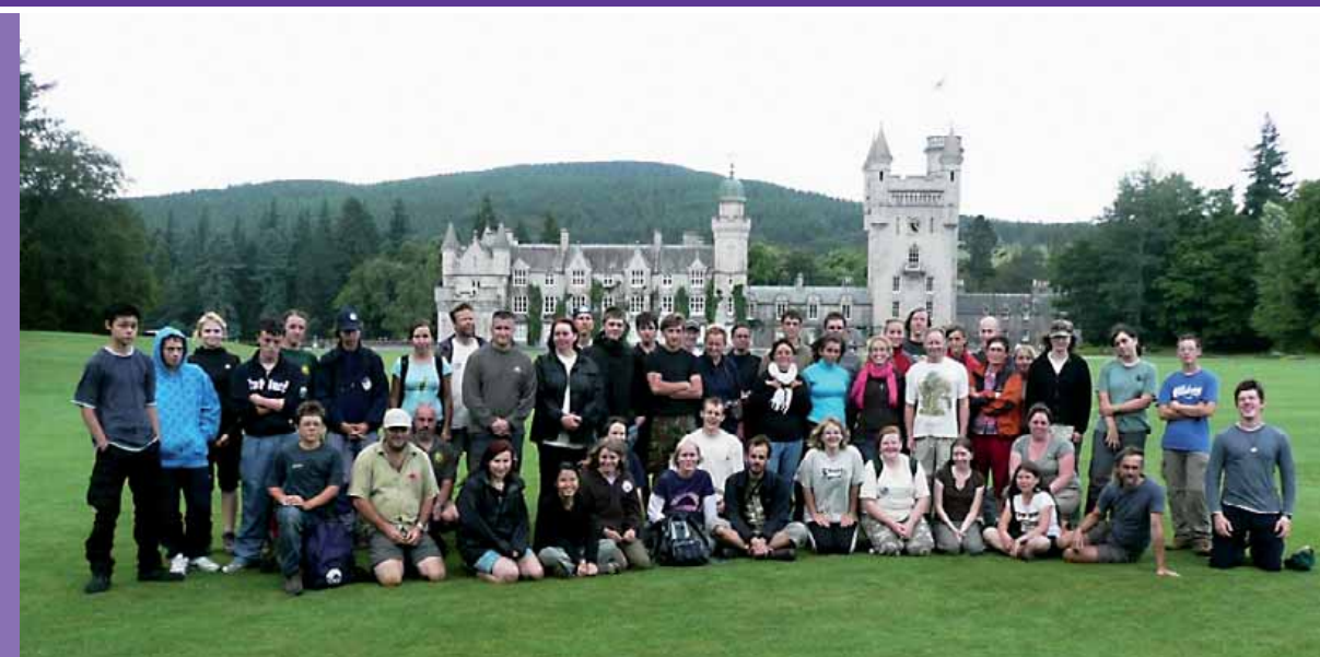
Junior Ranger group picture at Balmoral