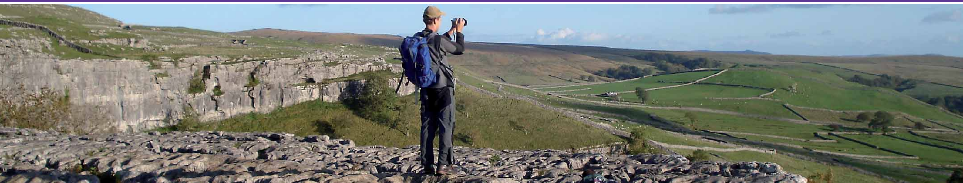
Malham Cove in the Yorkshire Dales.