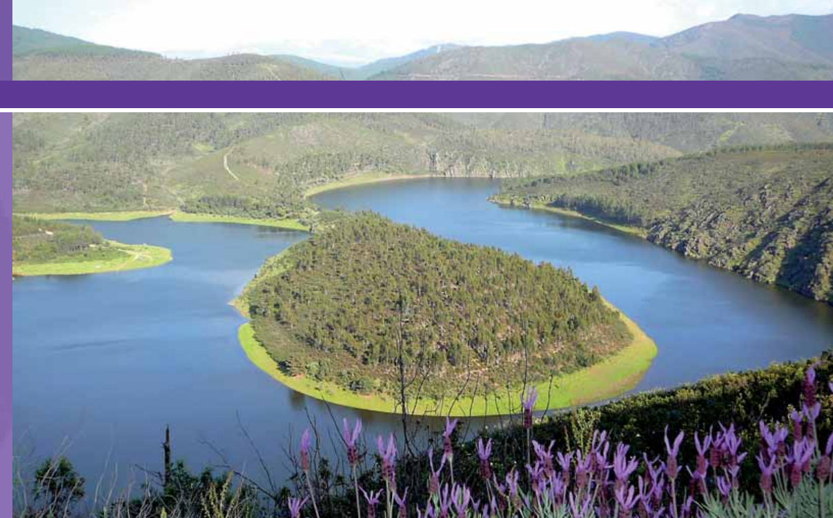
Sierras de Francia. Picture: Parque Natural Las Batuecas