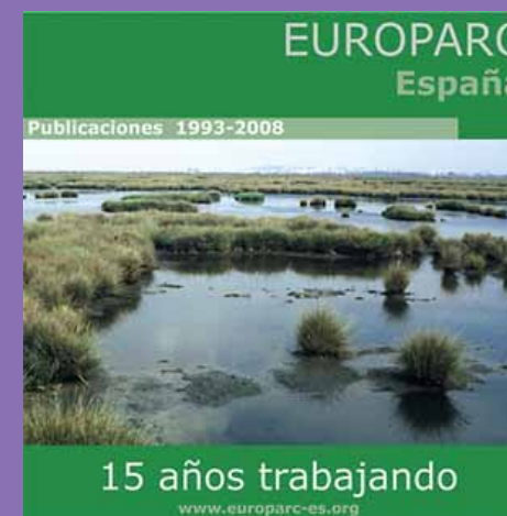
Celebrating 15 years of EUROPARC Spain