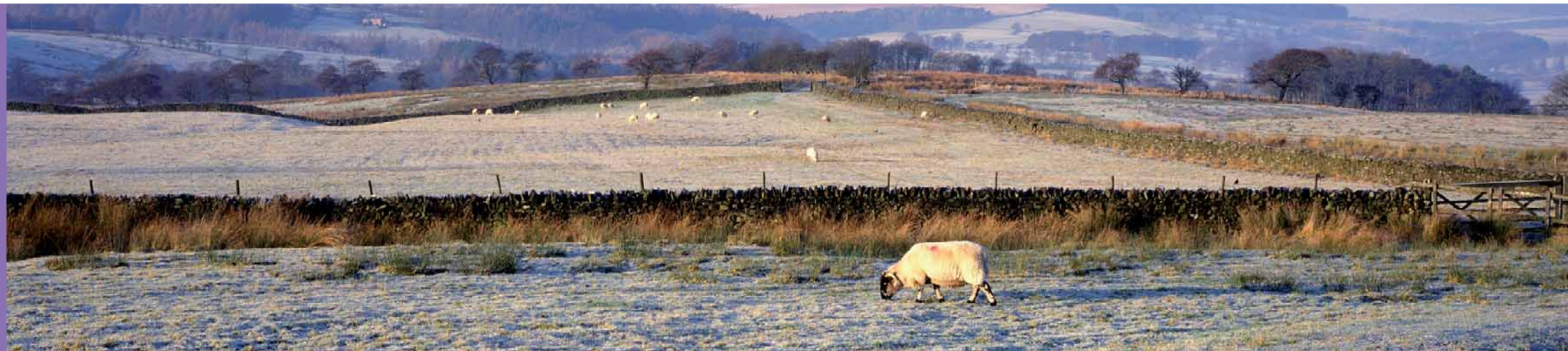
The Forest of Bowland AONB (UK).