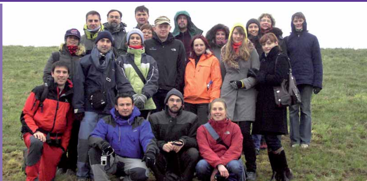
Participants of the first Grundvig Workshop.