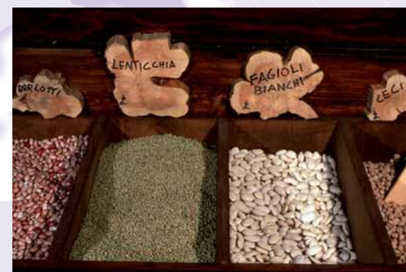
Local produce of the Monti Sibillini National Park.

The most important fields of work for the Section, over the next 12 months, will be getting new protected areas involved in the Charter process; the management of the European Volunteers project and the organisation of the next international workshop in Italy (April 09); the development of activities together with Slow Food; and to further enhance the partnership with the French Federation of Regional Parks in order to encourage the involvement of French regional parks in the EUROPARC Federation.