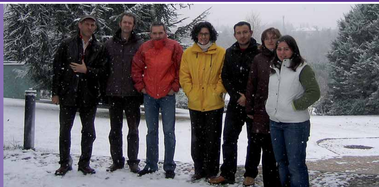
EUROPARC Spain Team