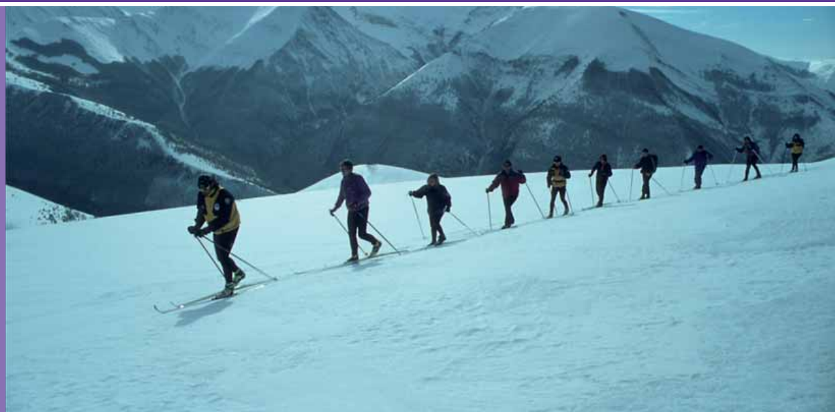
Skiers at Monti Sibillini National Park.