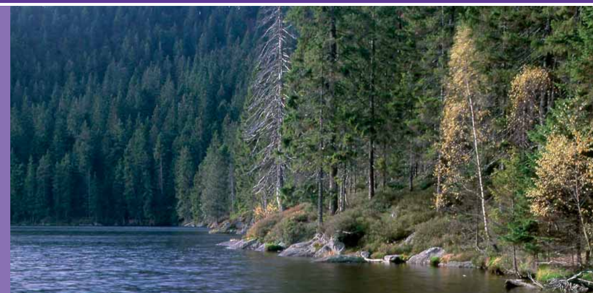
Čertovo Jezero in Šumava National Park (CZ).