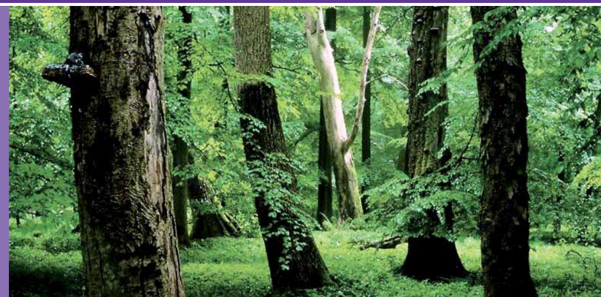
Hainich Nationalpark (DE).