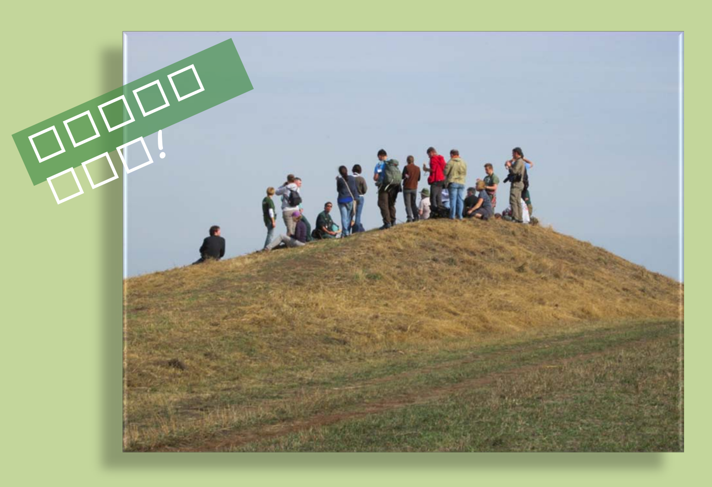
"Prepare yourself jointly for the new LIFE. Generations, organisations, locations!"