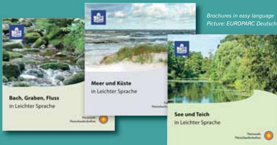
Brochures in easy language