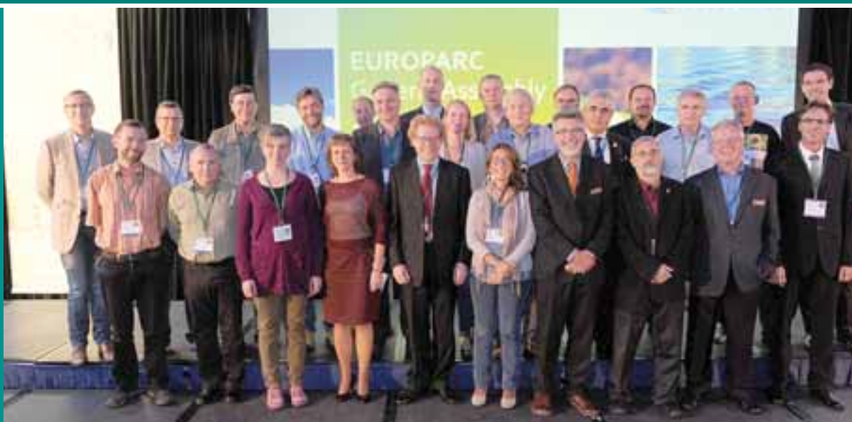
EUROPARC Working Groups and Steering Committees at EUROPARC Conference 2014

how to communicate the Charter more effectively according to needs of members and sections took place, in order for EUROPARC members to understand the benefits of the Charter better.