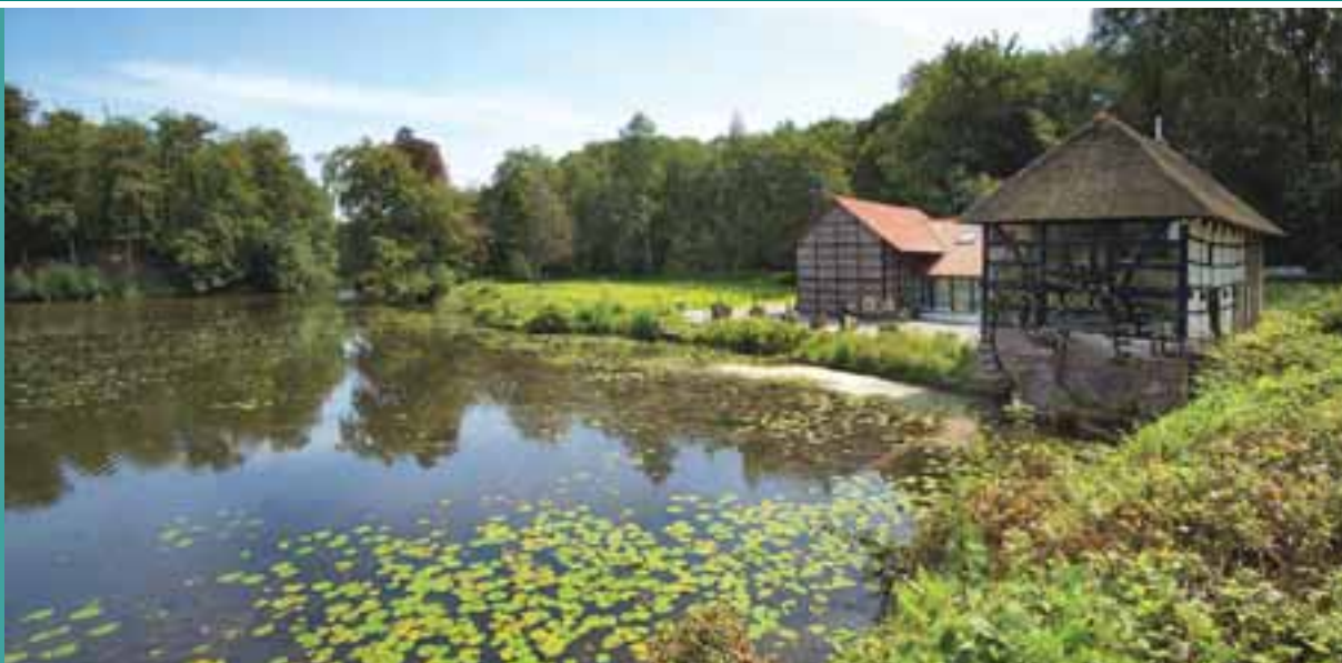
Watermill at Nature Reserve Tüschbroich (DE)

the broader public, collecting money by sponsorship and adoption schemes, visitor payback schemes and the ways to stimulate people to take responsibility. A region can benefit economically using its natural heritage as an asset, concluded the partnership.