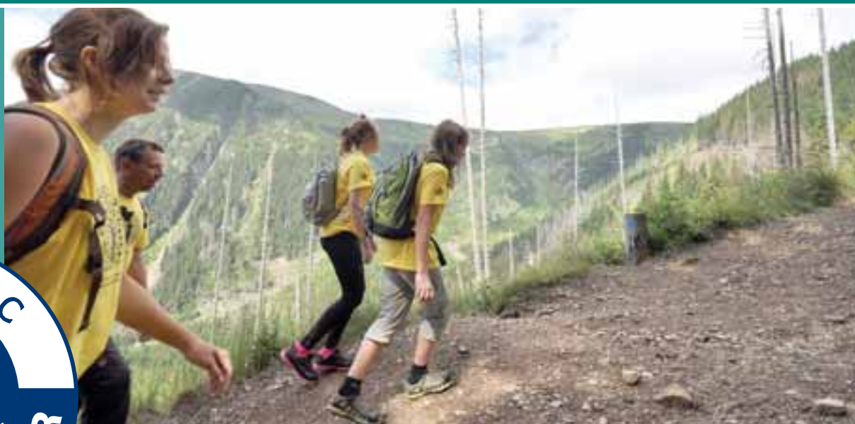
Discovering Krkonos National Park (CZ) during International Junior Ranger Camp 2014

During the course of the camp, Junior Rangers presented how their respective parks work on transboundary cooperation, or what are the initiatives and projects they manage in partnership with other parks across Europe. At the end of the camp it was clear how meaningless are today's borders, both for young people and for biodiversity!