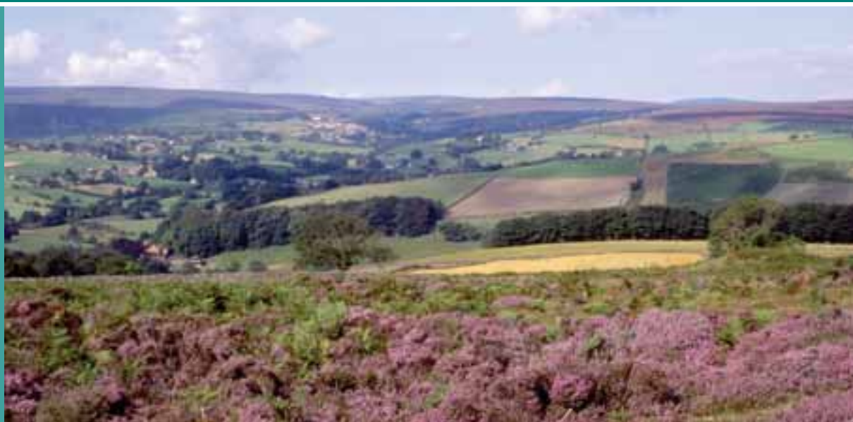
North York Moors National Park (UK)