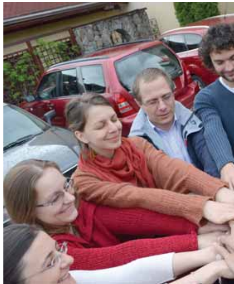
Team spirit during the 1 st Train the Trainer seminar in Romania