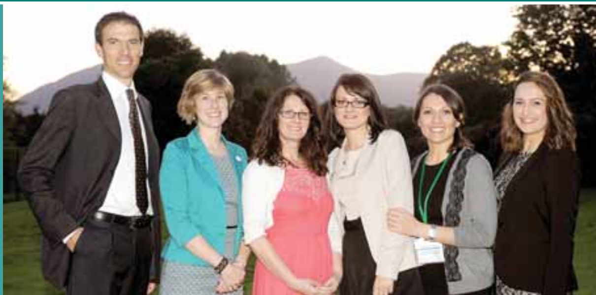
EUROPARC Team at EUROPARC Conference 2014 in Killarney (IE)