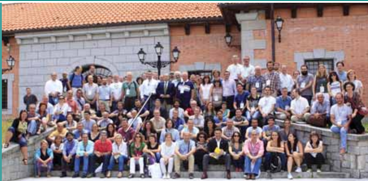
Participants at annual conference ESPARC 2014

European Day of Parks 2014. About 600 people enjoyed the day's activities "Parks for Nature. Parks for well-being. Parks for peace.", held in the biggest peri-urban park of Madrid city, "la Casa de Campo". EUROPARC Spain and the city of Madrid, through its Department of Environment and Health Mobility, organized the activities. On the other hand, the section co-operated with Spanish Association of Nature Photographers in organising the third photo contest of EUROPARC Spain.