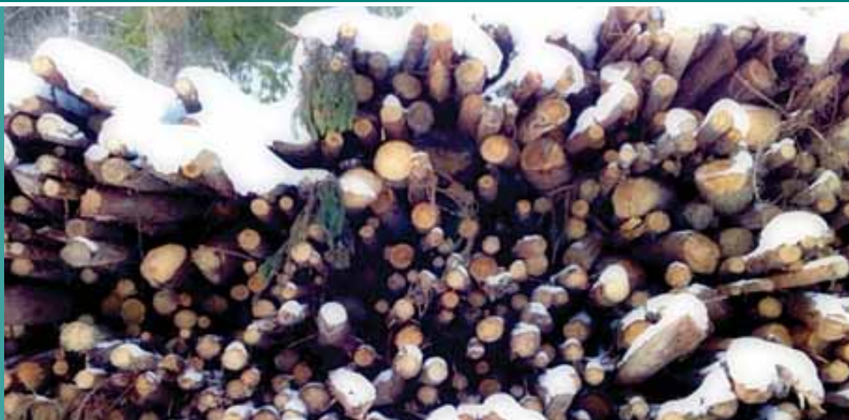
Woody biomass Picture: Dea Mijakovac