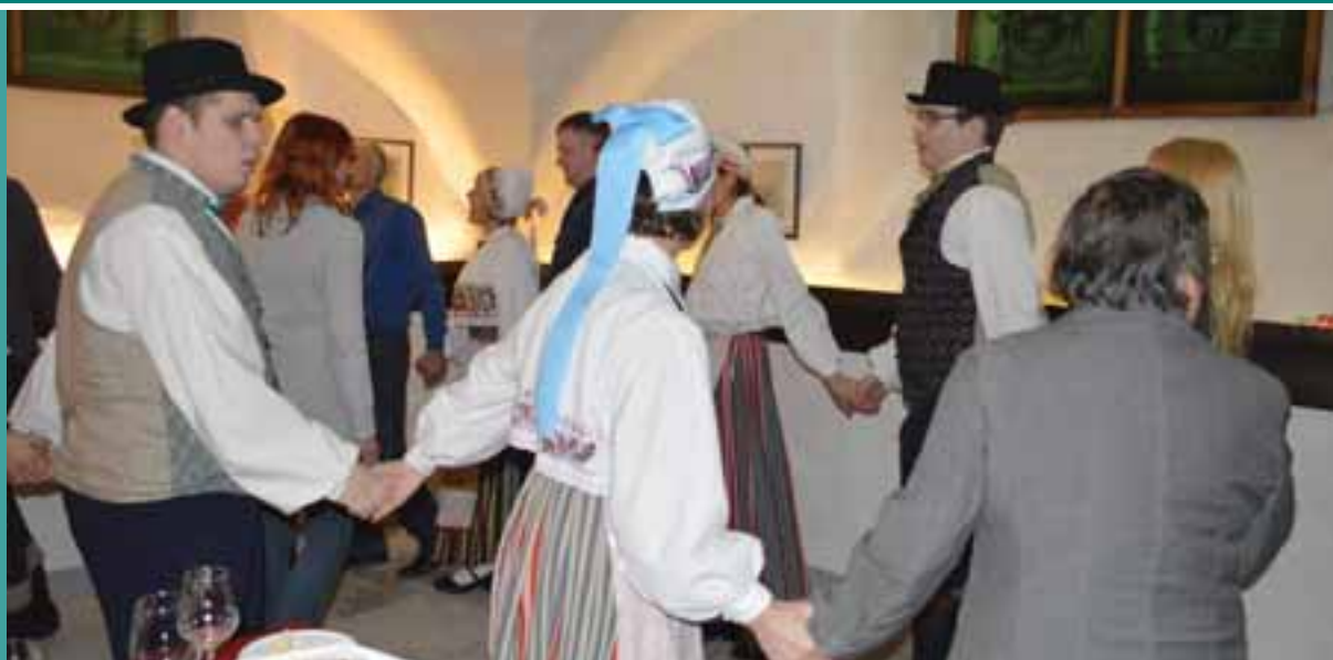
Experiencing cultural heritage in Protected Areas at seminar in Laheema National Park (EE)