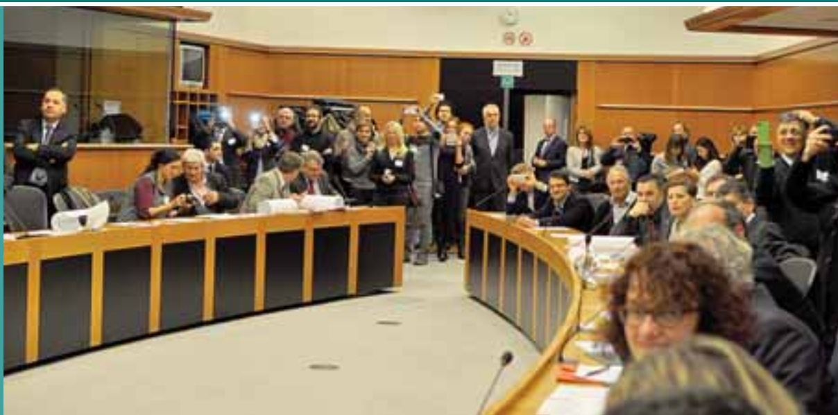
During the Charter Award Ceremony 2014 at European Parliament in Brussels (BE)