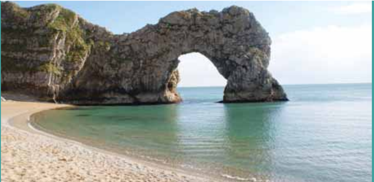
Dorset Coast at Durdle Door (UK)