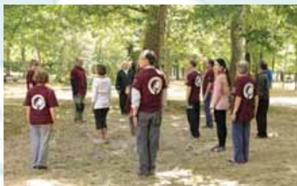
Celebration of the European Day of Parks 2014

Contact: Marta Múgica de la Guerra marta.mugica@redeuroparc.org