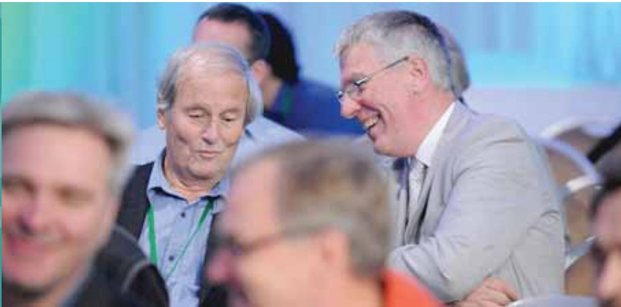
Members getting together at the EUROPARC Conference 2014 in Killarney (IE)

encouragement and motivation knowing we are part of a bigger movement.