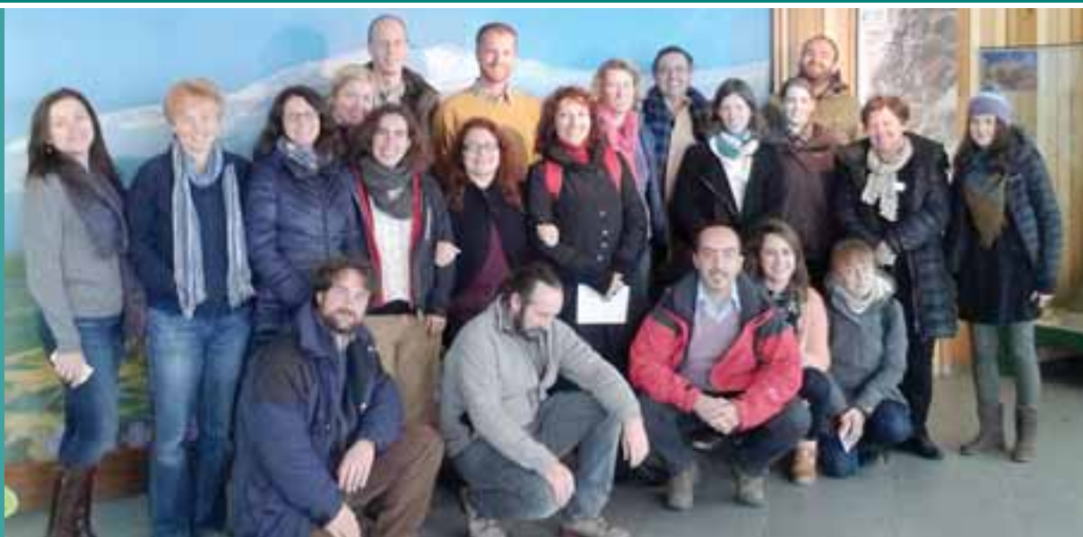
Participants at 1st Communications Training Course in Spain