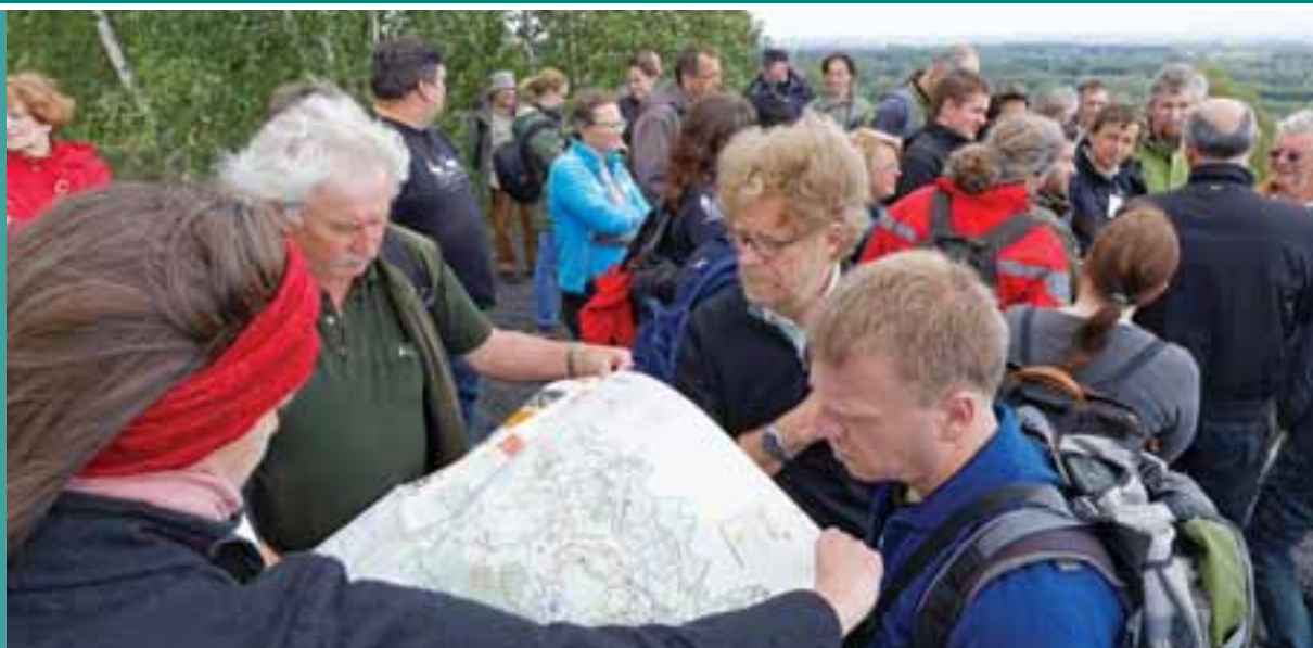
Exploring Hainaut cross-border Nature Park (BE/FR) during TransParcNet meeting 2014

Working Groups on common projects seem worthwhile.