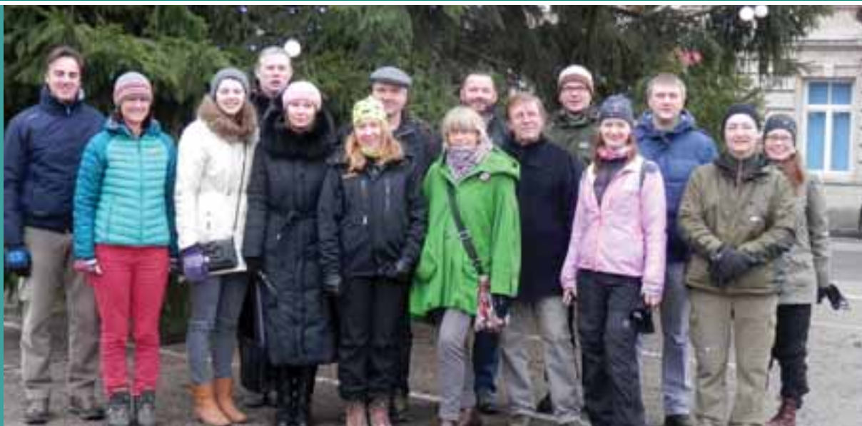
Participants at Health & Protected Areas seminar in Haapsalu (EE)