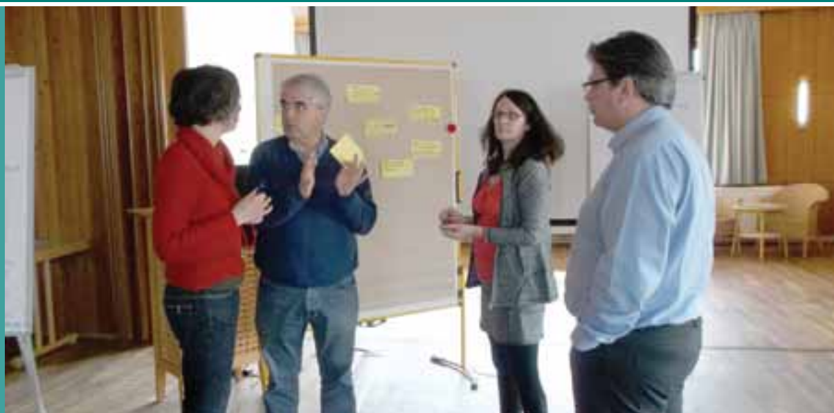
European Charter for Sustainable Tourism in Protected Areas Renewal and Retraining at BfN Academy in Vilm (DE)

awarding of 16 Protected Areas with the Charter. We were especially pleased to see the first Marine Protected Area certified: Area Marina Protetta Torre del Cerrano (IT). As in previous years, EUROPARC Consulting, with their great expertise, supported the Federation with the management of the verifications.