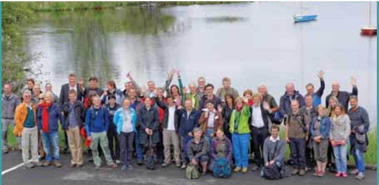
Participants at TransParcNet meeting 2014 in Hainaut cross- border Nature Park (BE/FR)