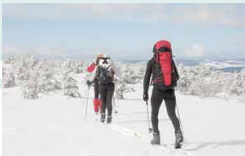
Enjoying cross-country skiing in Haut-Languedoc Regional Nature Park (FR)