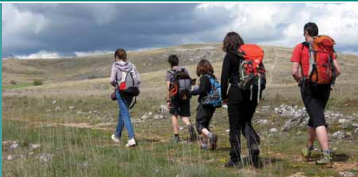
Hikers in Haut-Languedoc Regional Nature Park (FR)