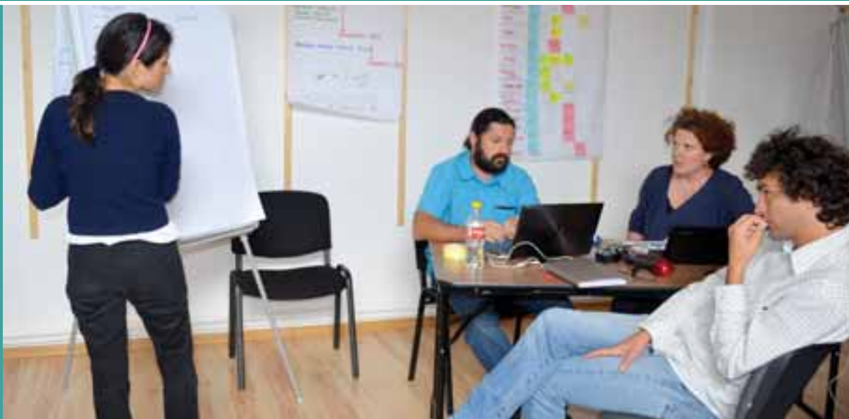
Working groups discuss content of online training seminar