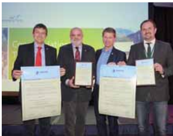
Representatives of Ecoregion Julian Alps (IT/SI) receive renewed EUROPARC Transboundary Certificate at conference 2014 in Killarney (IE)