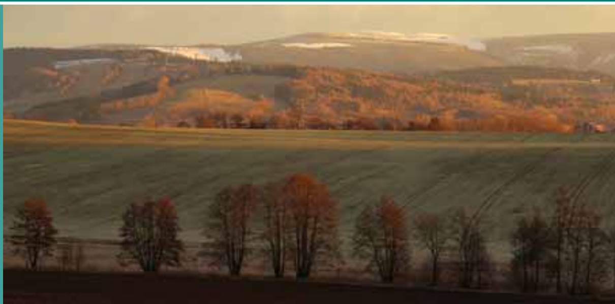
Krkonoše Mountains in early spring (CZ)