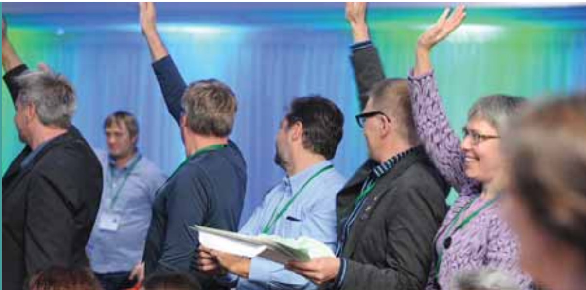
Members at the EUROPARC Conference 2014 in Killarney (IE)