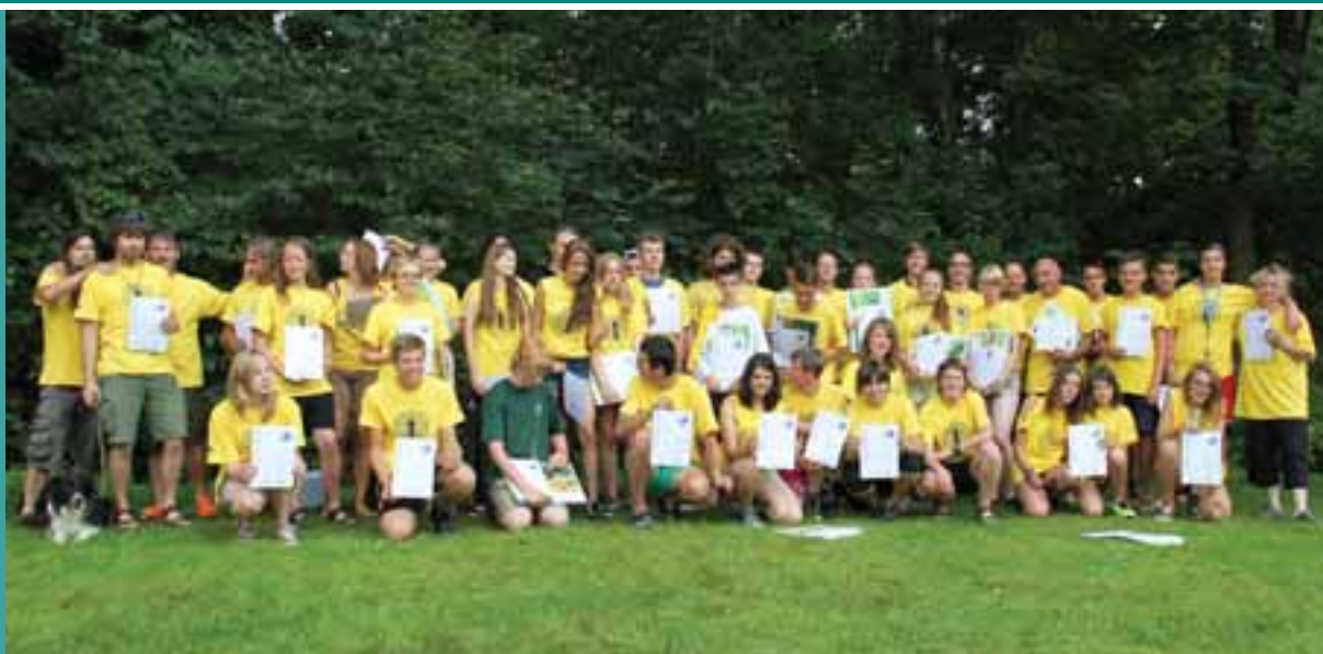
Participants at Junior Ranger Camp 2014 in Krkonosé National Park (CZ)