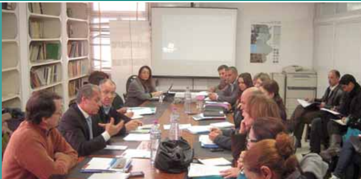
Federparchi providing training on sustainable tourism in protected areas according to the ECST methodology to Tunisian partners of MEET project

Ministry of Environment. In 2014 Federparchi organised several trainings and events about Charter part II and one Charter national network meeting, focused on exchange of best practices, relation between local businesses and parks, monitoring and evaluation, marketing, tourism and Natura 2000.