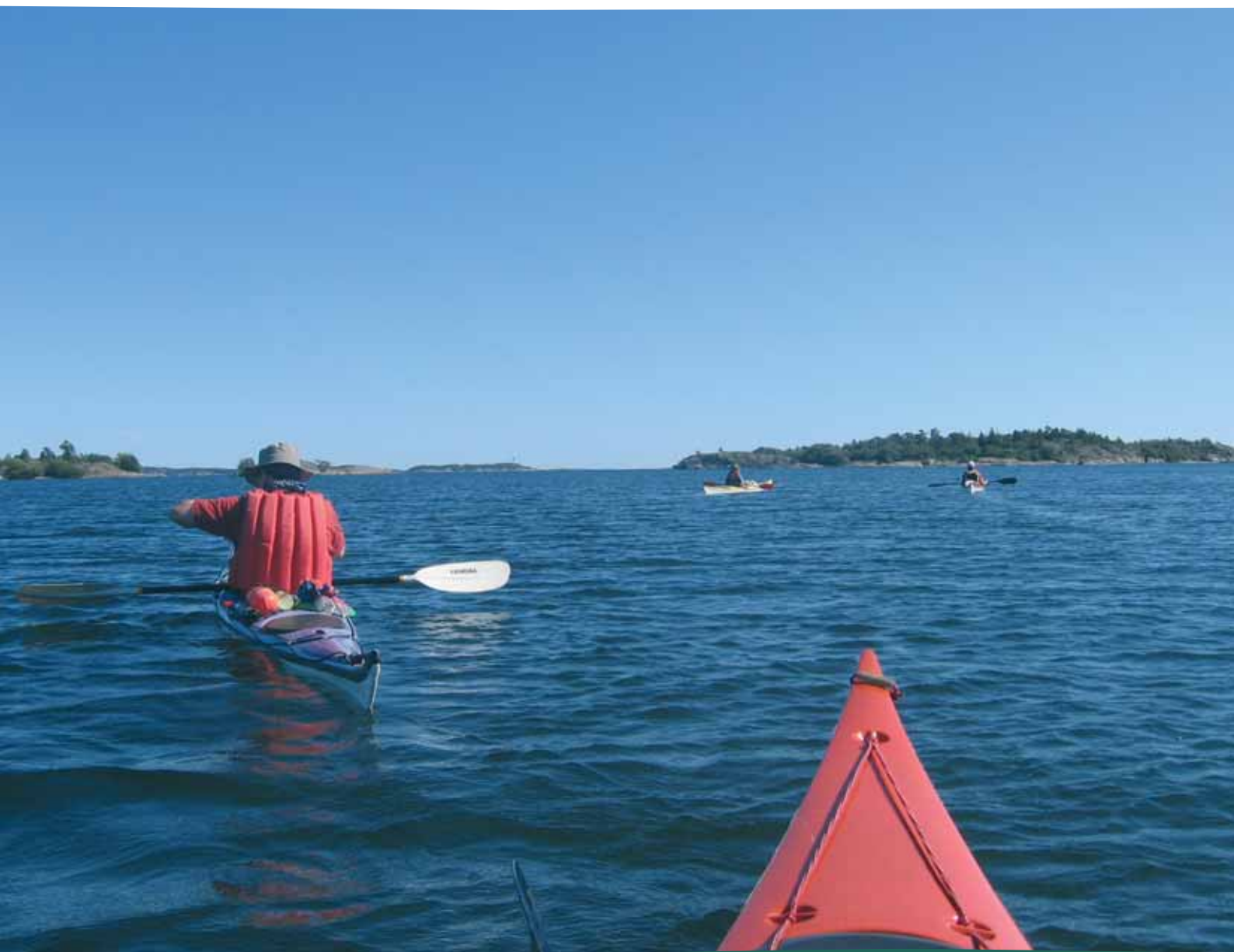
The park provides visitors with the possibility to experience marine wilderness by establishing a non-intervention wilderness zone and a wilderness-like zone for visitors

In order to achieve the goal of leaving the marine wilderness as intact as possible and making parts of it accessible to visitors at the same time, a well-worked out cooperation should be reached with locals and visitors alike. Open discussions and a proper exchange of information about management objectives with locals, as well as friendly guidance offered to visitors, will help park management implement objectives and provide services in a way that best serve the interests of the valuable marine environment of Archipelago NP.