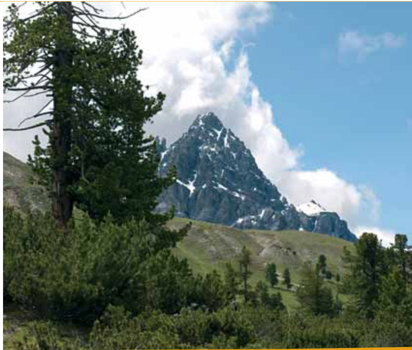
The wilderness area provides for a great scientific laboratory

of special importance, namely, the examination of natural development in an area safeguarded from human interference. The wilderness area provides for a great scientific laboratory, and the long history of non-intervention management in the national park has offered invaluable opportunities for research projects to be conducted over prolonged periods. These projects facilitate the documentation of natural processes and as such, greatly contribute to our understanding of alterations occurring in habitats safe from human interference. Results obtained describe the natural development of animal populations and plant associations, as well as changes in the landscape. At present, research workers are involved in 78 different projects on issues such as fire succession, ungulates in alpine habitats, long-term forest ecosystem research, and population dynamics of the chamois.