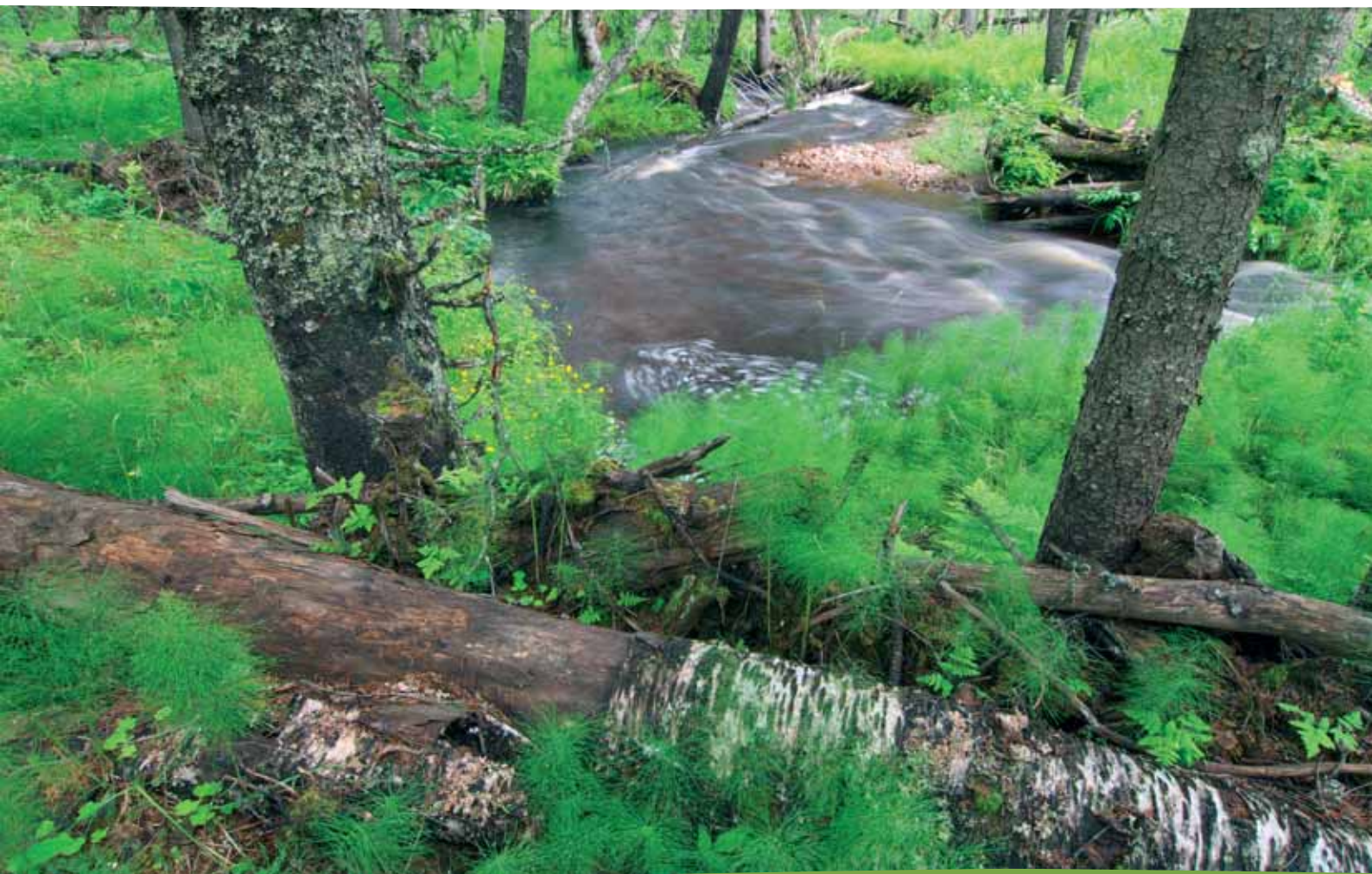
The site left untouched after a dramatic flooding and thus covered in dead wood decaying naturally, is one of the biggest attractions of the national park, equipped with interpretation boards for visitors to learn about natural processes

As part of the comprehensive and concise non-intervention management approach, Fulufjället NP is utilising the remnants of a natural disturbance event in Göljadalen Valley as a unique interpretation site. During the 1997 'centennial flood' an estimated 10,000 cubic metres of trees were felled by flash flooding. The management of the nature reserve (status of the area at that time) decided to leave the large amount of timber untouched after the dramatic erosion that followed the extreme downpour. Today the site, covered in dead wood decaying naturally, is one of the biggest attractions of the national park, equipped with interpretation boards for visitors to learn about natural processes.