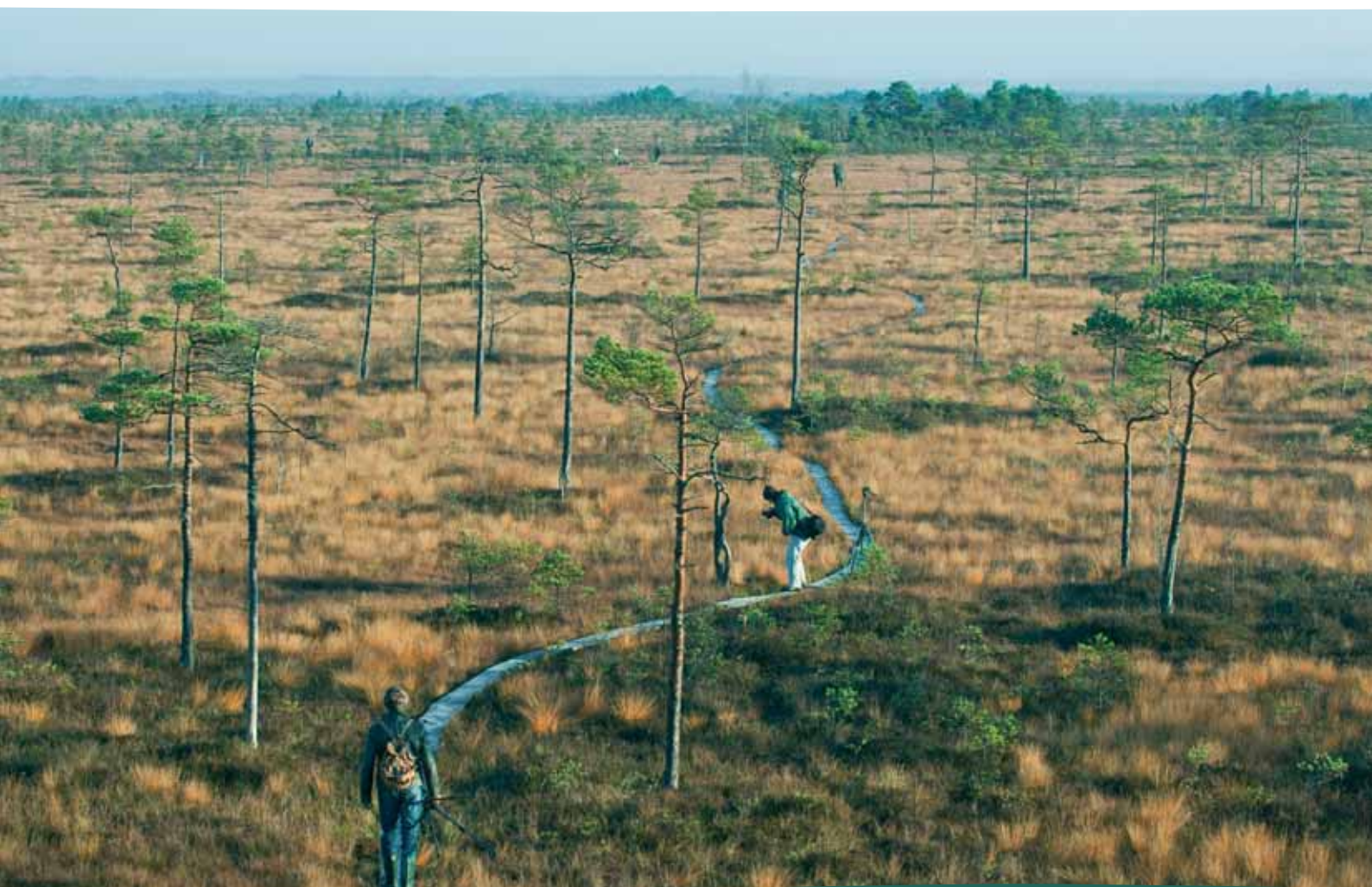
Soomaa NP has established a specially designated infrastructure for the general public to visit and experience wilderness – Photo: Arne Ader

Snowshoe tours in Soomaa are strictly controlled and are only provided by a limited number of local tour operators, all working in cooperation with the National Environmental Board, keeping preservation of Soomaa's wilderness values in the focus of their attention. What this means in practice is that even without any written regulations, business partners offering these tours have developed alternate snowshoeing routes for May and June, the bog waders' breeding time, thus avoiding sensitive territories where they may disturb the breeding process.