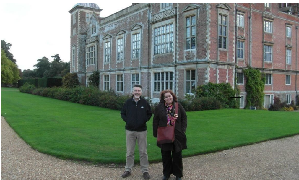
Two EUOPARC Consulting experts in front of Blickling Hall, Norfolk (UK), venue for one of the COOL workshops

The project brought together staff teams with diverse skill-sets including tourism and marketing, countryside management, heritage and cultural management, community working and healthy living. It brought in outside know-how from researchers and technical experts who are on the large EUOPARC Consulting panel.