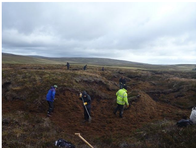
Current efforts to conserve and enhance the carbon-sink properties of the UK's northern peatlands are not sufficient

west Pennine moors) focusing on restoration and creation of functioning peat bogs using novel surface re-vegetation techniques.