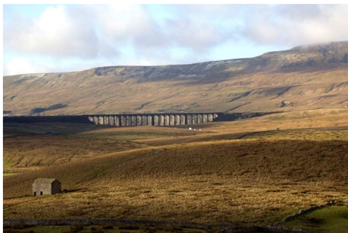
The magnificent 19th railway viaduct looks remote but has become a major visitor honeypot

Most national parks and other protected areas often struggle hard to protect the precious natural and cultural heritage in their area from too many visitors. One of England's most