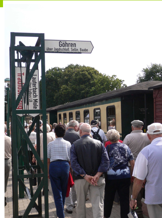
Rügen – Railway system