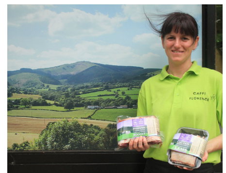
Clwydian Range Lamb Brand