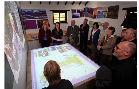
AV Room at Loggerheads Country Park

9 An increasing number of farmers are returning to the traditional management that the moorlands depend upon because of the opportunities that these new markets provide.