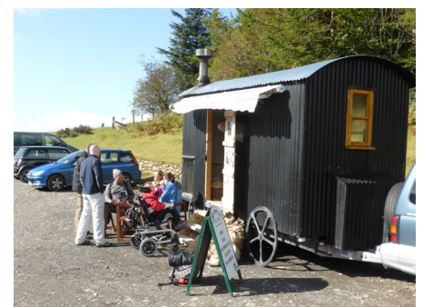
Shepherds Hut – Moel Famau Country Park