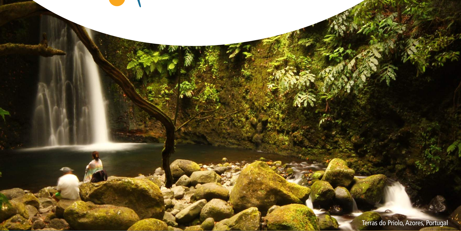
Terras do Priolo, Azores, Portugal

EUROPARC Sustainable Tourism in Protected Areas