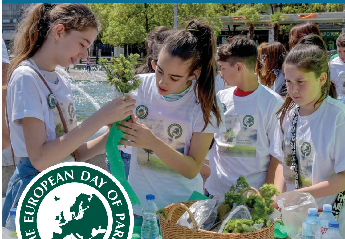
Celebration of the European Day of Parks 2017 in Montenegro

www.EUROPARC.org/european-day-parks-edop-2017/