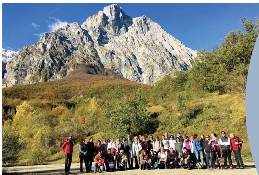
Field trip in Gran Sasso National Park, Italy, Charter Network Meeting 2017