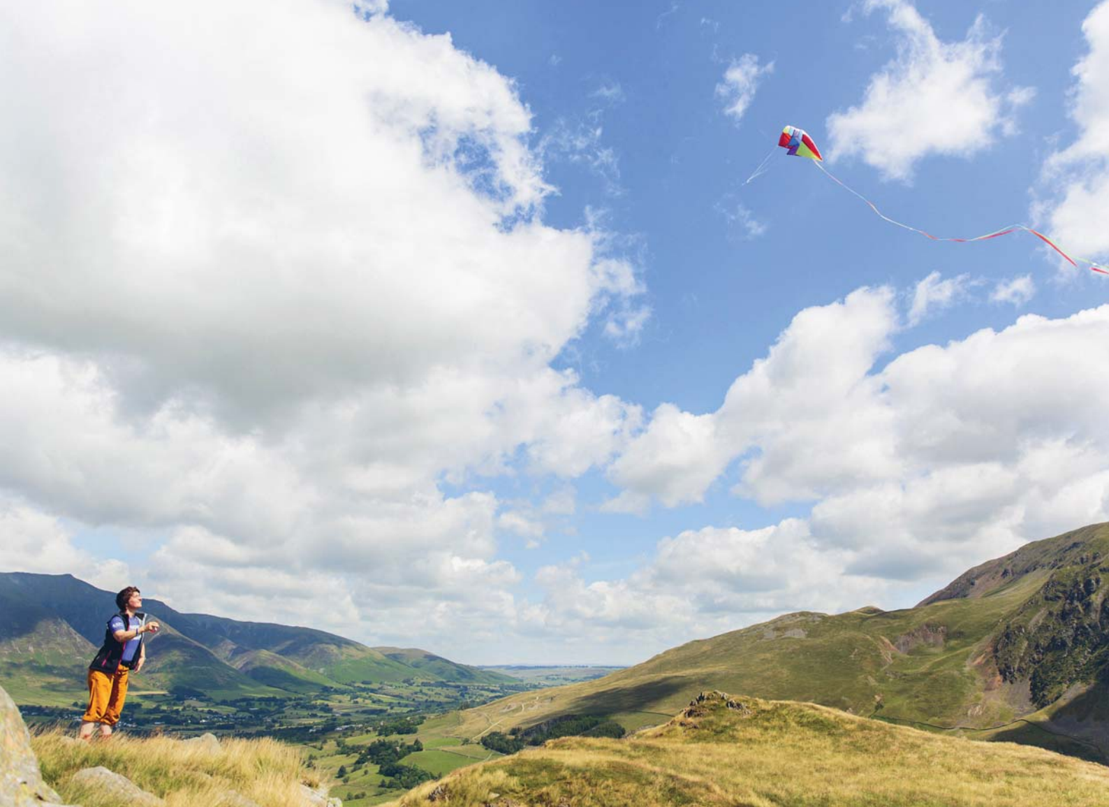
Lake District National Park, UK