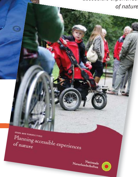
New guideline "Planning accessible experiences of nature"