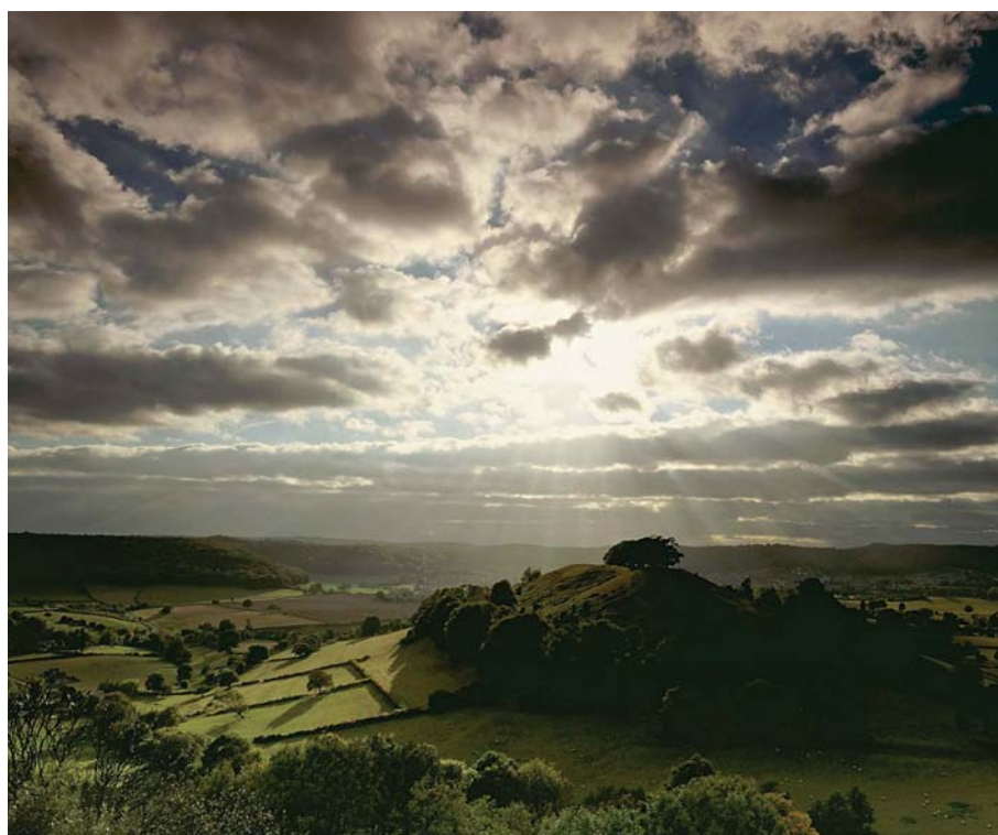
Costwolds National Park, UK, Countryside Agency

We have developed a new strategy yet the major challenge continues to be resources to fund the work of the section to deliver the strategy.