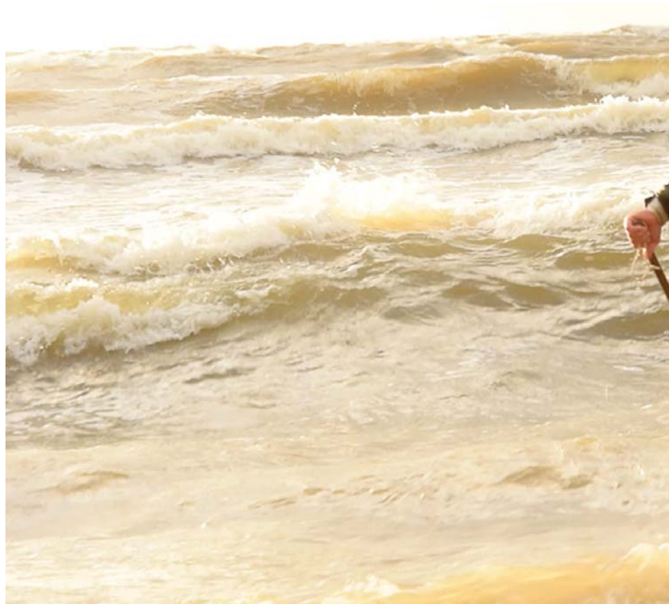
Ambar catchers in Lithuania

The TransParcNet meeting also focused on the topic of climate change, where Parks shared concrete projects and activities being implemented across borders.