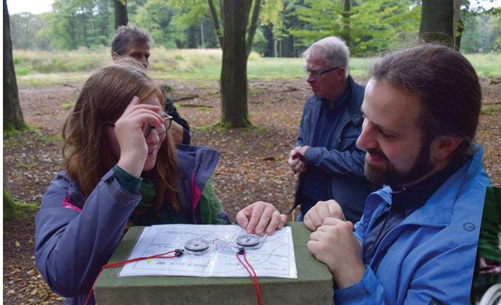
German study group gains insight into educational offers of the Dutch De Sallandse Heuvelrug National Park (author: Neele Larondelle)