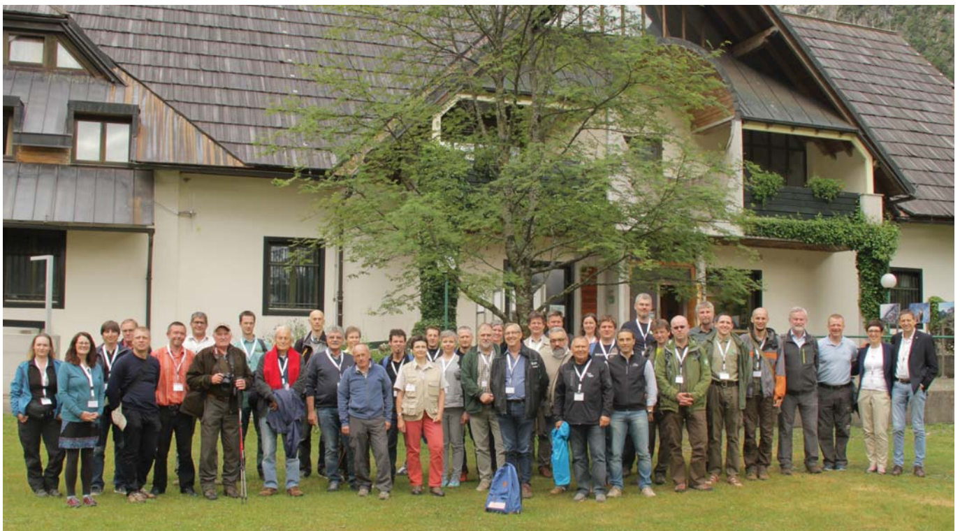
Participants of the TransParcNet 2017 in the Julian Alps Transboundary Ecoregion (IT/SL)

www.EUROPARC.org/discover-our-transboundary-areas/