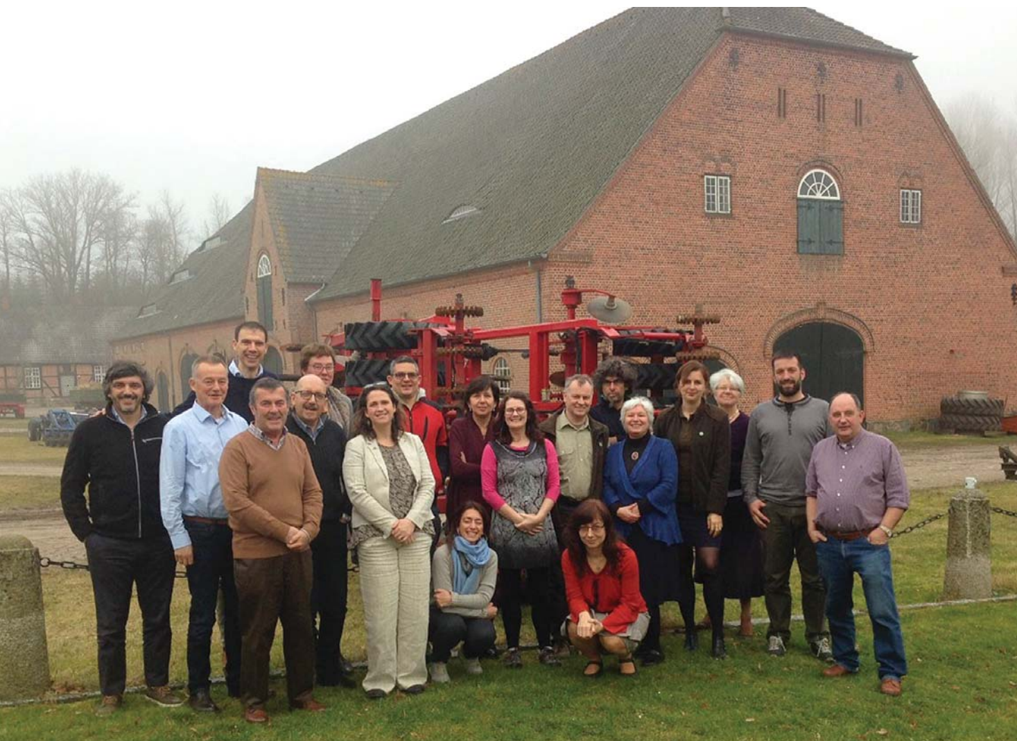
Participants of Siggen Seminar 2017