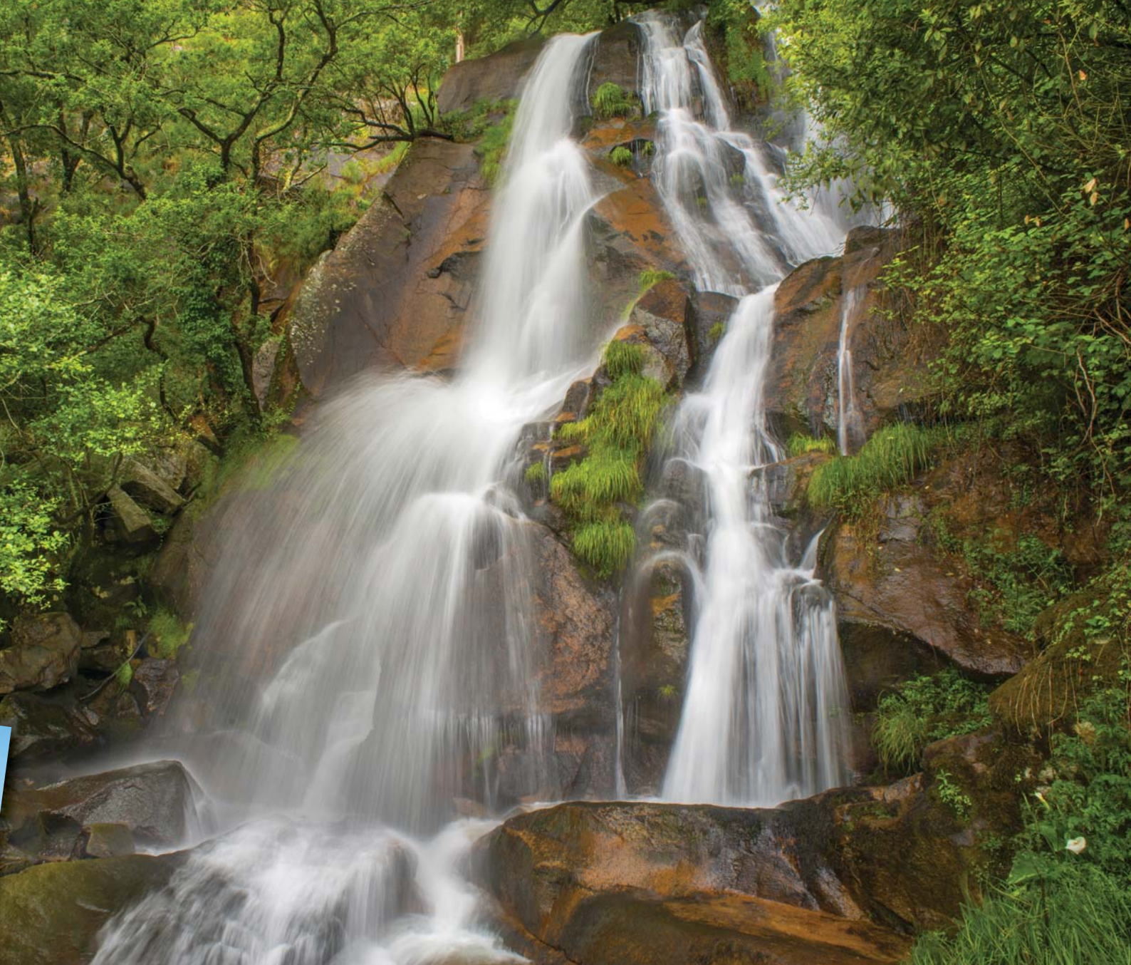
Fivelda waterfall, Magic Mountains, Portugal