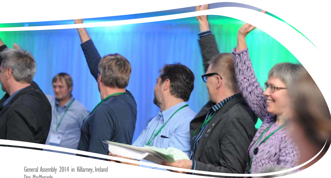
General Assembly 2014 in Killarney, Ireland

With the addition of Fedenatur into EUROPARC, we now represent and support the work of periurban parks across Europe.