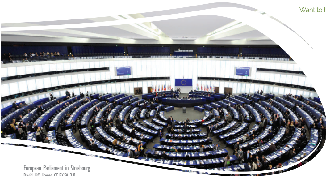
European Parliament in Strasbourg

Want to highlight the importance of Protected Areas?