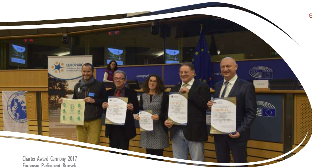
Charter Award Ceremony 2017 European Parliament, Brussels