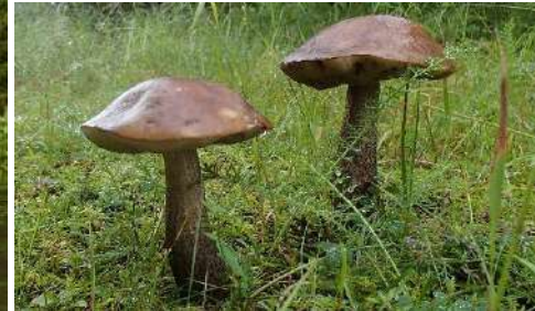
Mushroom & berry picking