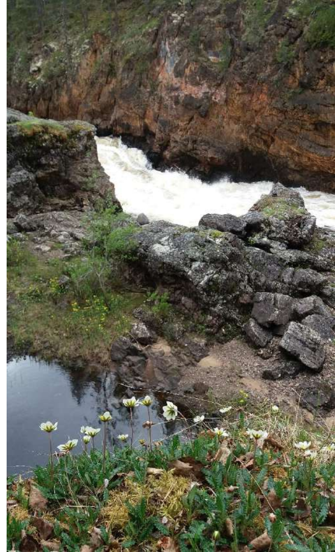
Mountain avens →