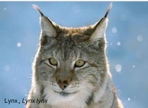
Lynx, Lynx lynx