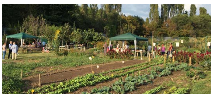
The communal garden Niguarda managed by the Parco Nord Milano, Italy, is a project of urban social agriculture started in 2014 to promote social cohesion through sharing of agricultural and manual practices