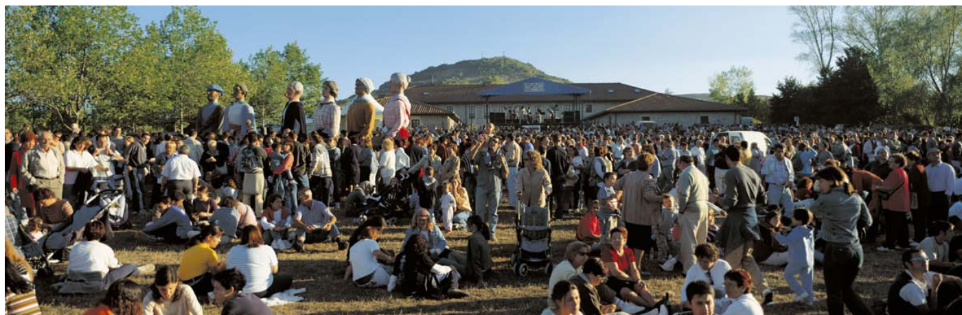
Casa de la Dehesa de Olárizu, Green ring, Vitoria-Gasteiz

europarc.org/case-studies/host-a-massive-event-in-a-natura-2000-site-grand-parc-miribel-jonage/