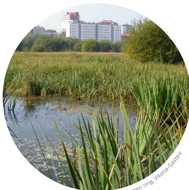
Salburua Park, Green ring, Vitoria-Gasteiz

DG ENV Directorate-General for the Environment