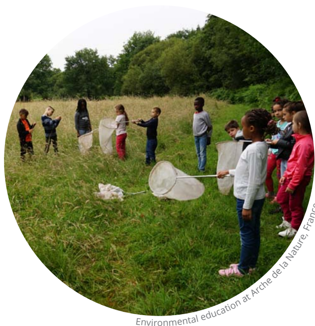
Environmental education at Arche de la Nature, France

DG EAC Directorate-General Education, Youth, Sport and Culture