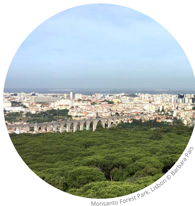
Monsanto Forest Park, Lisbon

DG ENV Directorate-General for the Environment DG REGIO Directorate-General for Regional & Urban Policy DG RTD Directorate-General for Research & Innovation DG JRC Joint Research Centre