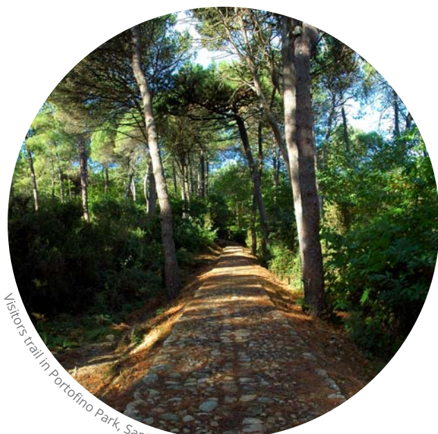
Visitors trail in Portofino Park, Santa Margherita Ligure