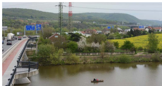
Vltava river in Prague, Czech Republic

Parco di Portofino participates in the T.R.I.G-Eau project (2014 - 2020 INTERREG V-A Italy - France (Maritime)). The project aims to develop the resilience of the territories by promoting green infrastructure for the management of meteorological outflows , in order to re-stabilise the water cycle, promoting infiltration and reducing the runoff effect.