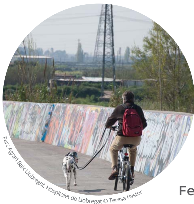
Parc Agrari Baix Llobregat, Hospitalet de Llobregat

Under a scenario of further urbanisation, and hence a further loss of natural habitats and biodiversity, EUROPARC Federation calls upon cities to be actively involved in the protection of the remaining valuable nature in their vicinity and so derive the many benefits Periurban Parks can bring.