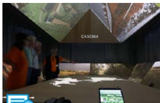
Case study: The Casa del Parco , an interactive multimedia facility (IT)

europarc.org/case-studies/casa-del-parco-interactive-multimedia-facility-located-inside-cascina-centro-parco/