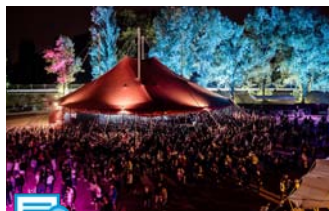
Case Study: To host a massive event in a Natura 2000 site, the Grand Parc Miribel-Jonage (FR)

europarc.org/case-studies/casa-del-parco-interactive-multimedia-facility-located-inside-cascina-centro-parco/