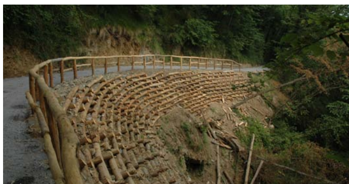
Nature engineering in Portofino Park, Italy

Nature-based solutions to societal challenges are defined as solutions that are inspired and supported by nature; which are cost-effective; simultaneously provide environmental, social and economic benefits and help build resilience. Such solutions bring more and diverse natural features and processes into cities, landscapes and seascapes, through locally adapted, resource-efficient and systemic interventions.