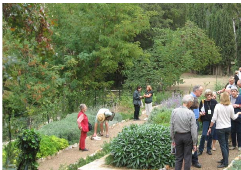
Botanical garden, Mt Hymettus Aesthetic Forest, Athens

Most Periurban Parks host a surprisingly rich and diverse wildlife and many of them are classified as Natura 2000 sites , thus contributing to Target 1. Protect species and habitats.