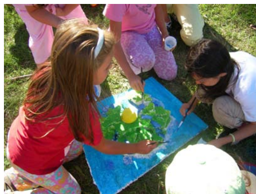
Environmental education at Parco Nord Milano, Milan