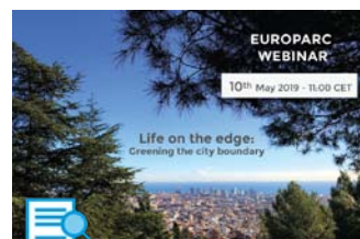
Webinar: Life on the Edge - Greening the city boundary

europarc.org/case-studies/corporate-social-responsibility-activities-in-collserola-nature-park/