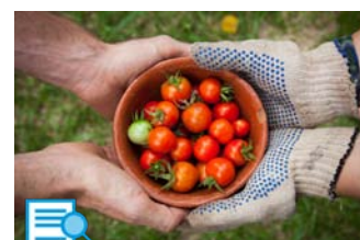
Case Study: Transition to agroecology in Collserola Nature Park enhanced with a participatory process (ES)

With their location close to cities, periurban agriculture parks have access to a large local market. Thus, Periurban Parks contribute to Target 3. Achieve more sustainable agriculture and forestry.