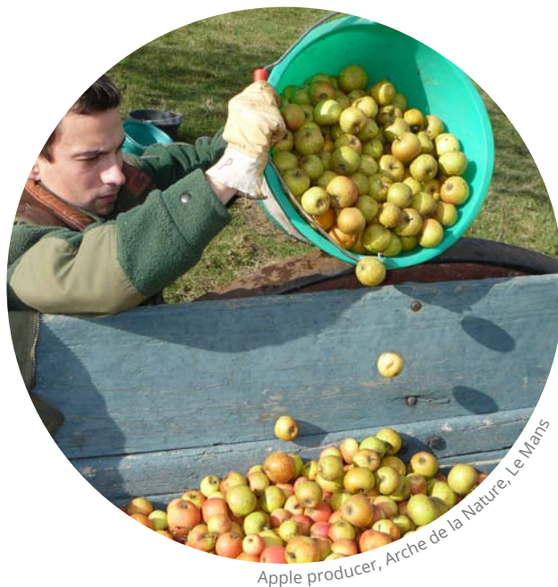
Apple producer, Arche de la Nature, Le Mans