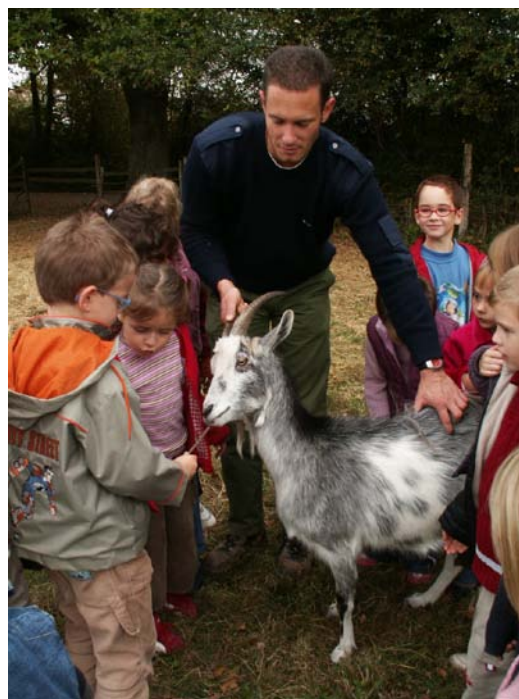
Environmental education at Arche de la Nature, Le Mans

L'éducation à l'environnement: un enjeu primordial pour les parcs naturels périurbains