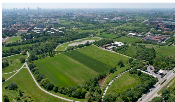
Parco Nord Milano, Milan