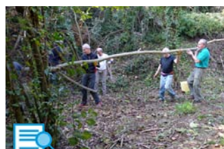
Case Study: Corporate Social Responsibility Activities in Collserola Nature Park (ES)

europarc.org/case-studies/creation-educational-botanical-garden-mt-hymettus-aesthetic-forest