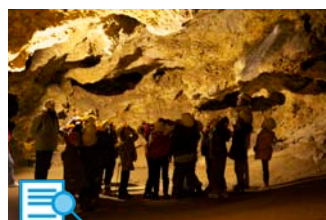
Case Study: Education and interpretation in the Nature Park Medvednica (HR)

europarc.org/case-studies/education-interpretation-nature-park-medvednica/