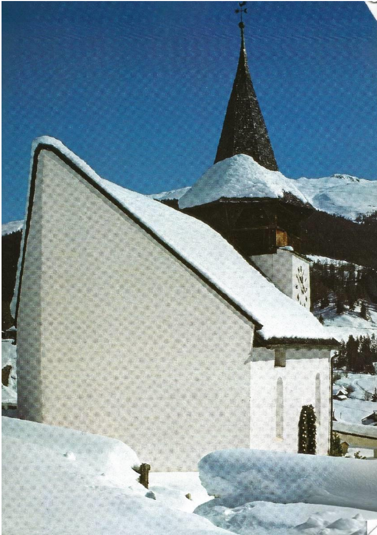
Paravalanche church, Grisons, Thusis