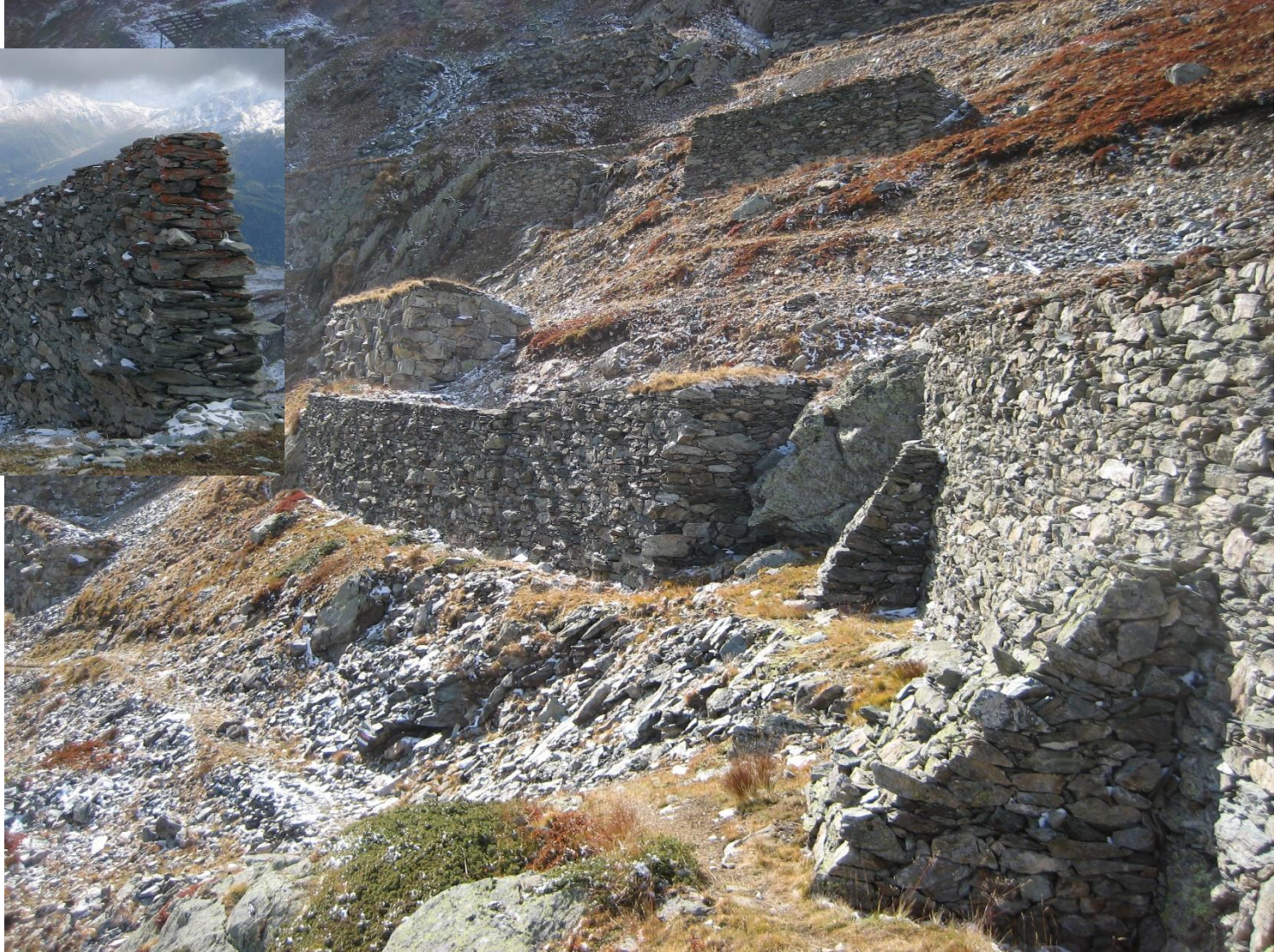
Wall above the railway station in Goppenstein