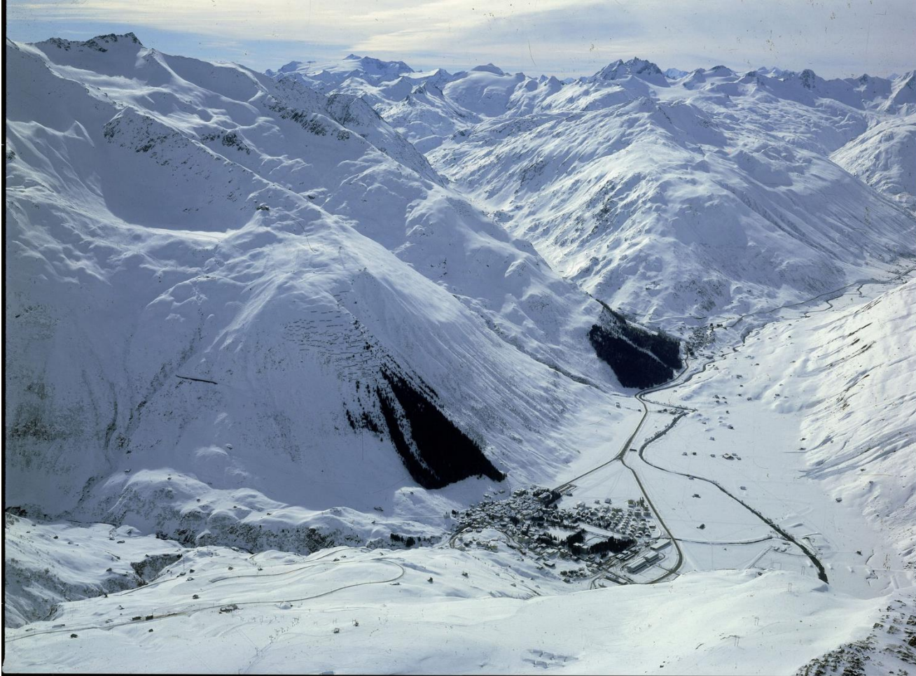
Andermatt village protection forest