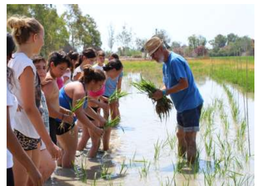
Winners of the 2019 STAR Awards, top to bottom:

Sud Randos