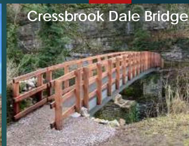
Cressbrook Dale Bridge